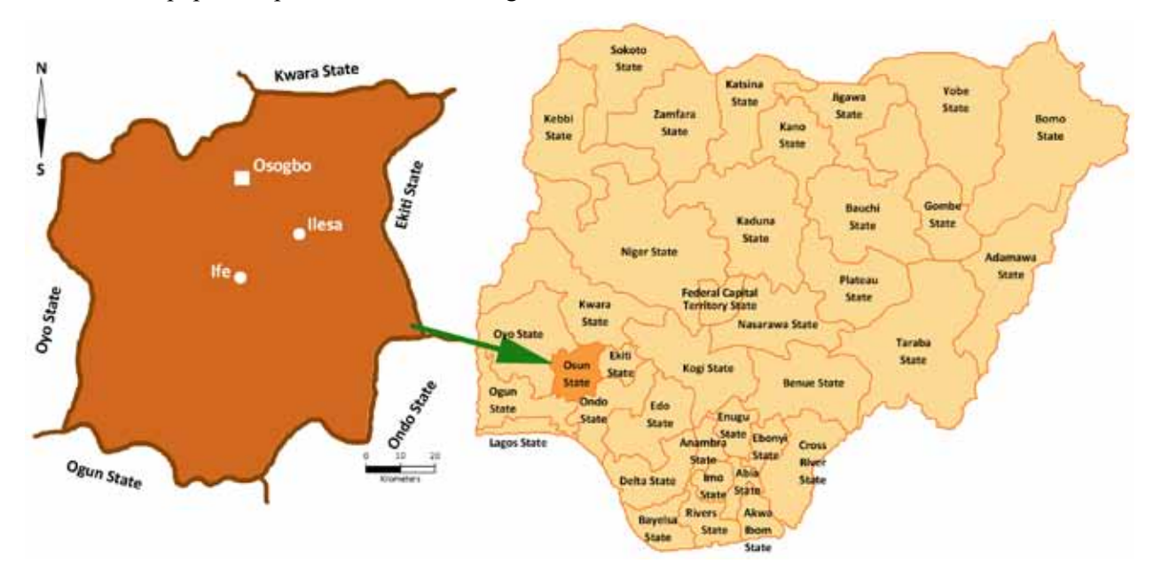
Fig. 1. Map of Osun State and the study areas

The faecal samples collected were immediately streaked on prepared MacConkey agar plates and incubated at 37 °C for 24 hours for isolation of Enterobacteriaceae. Distinct colonies were picked and sub-cultured by successive streaking on freshly prepared MacConkey agar plates, incubated at 37 °C for 24 hours and a pure isolates were obtained. These were stored on nutrient agar slant and kept in the refrigerator at 4 °C for further use. All the isolates were identified using cultural, morphological, microscopic examination and biochemical tests following standard procedures and interpreted according to BERGEY's Manual of Systematic Bacteriology. Isolates were further confirmed using Analytical Profile Index (API) 20E test kit (BioMérieux, Inc., France).