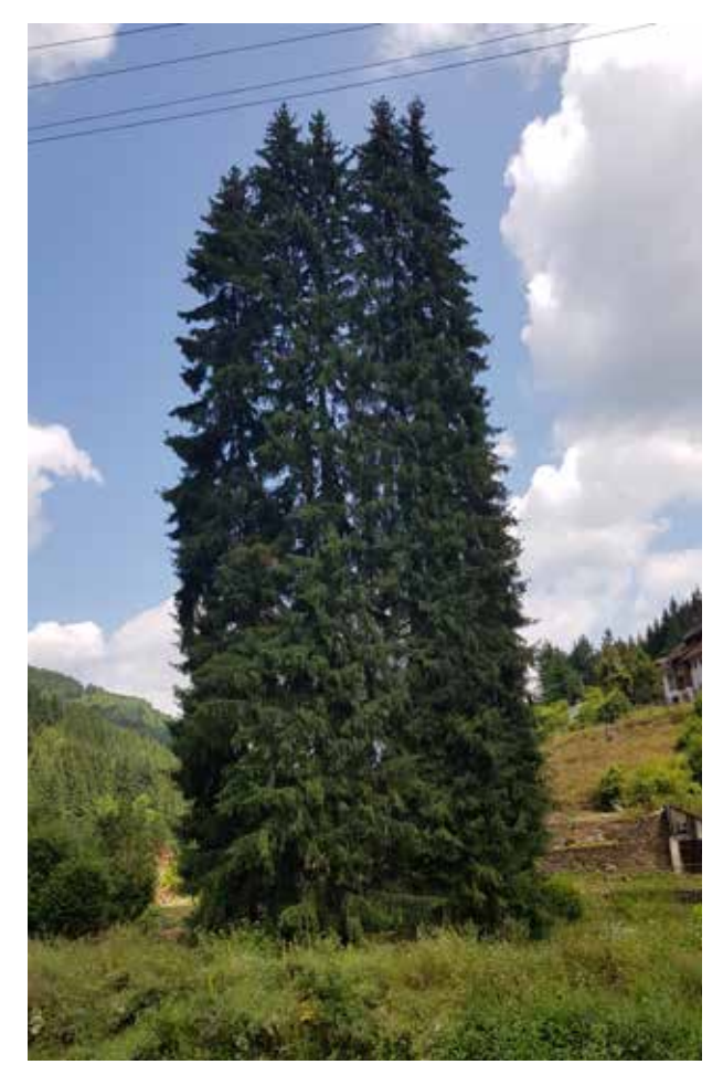
Fig. 1. Three 100-year-old Picea abies (L.) H. Karst. trees

Our research was conducted in a group of three solitary trees of Picea abies (L.) H. Karst. The trees were 97 years old ( Fig. 1 ). They were planted in the village of Brod (42°84'88" north latitude and 22°28'39" east longitude) in 1925. The village is on Mount Čemernik, Crna Trava municipality, at an altitude of 856 m. The five control trees grew in a nearby spruce culture (within a 100 m radius) founded in the 1970s.