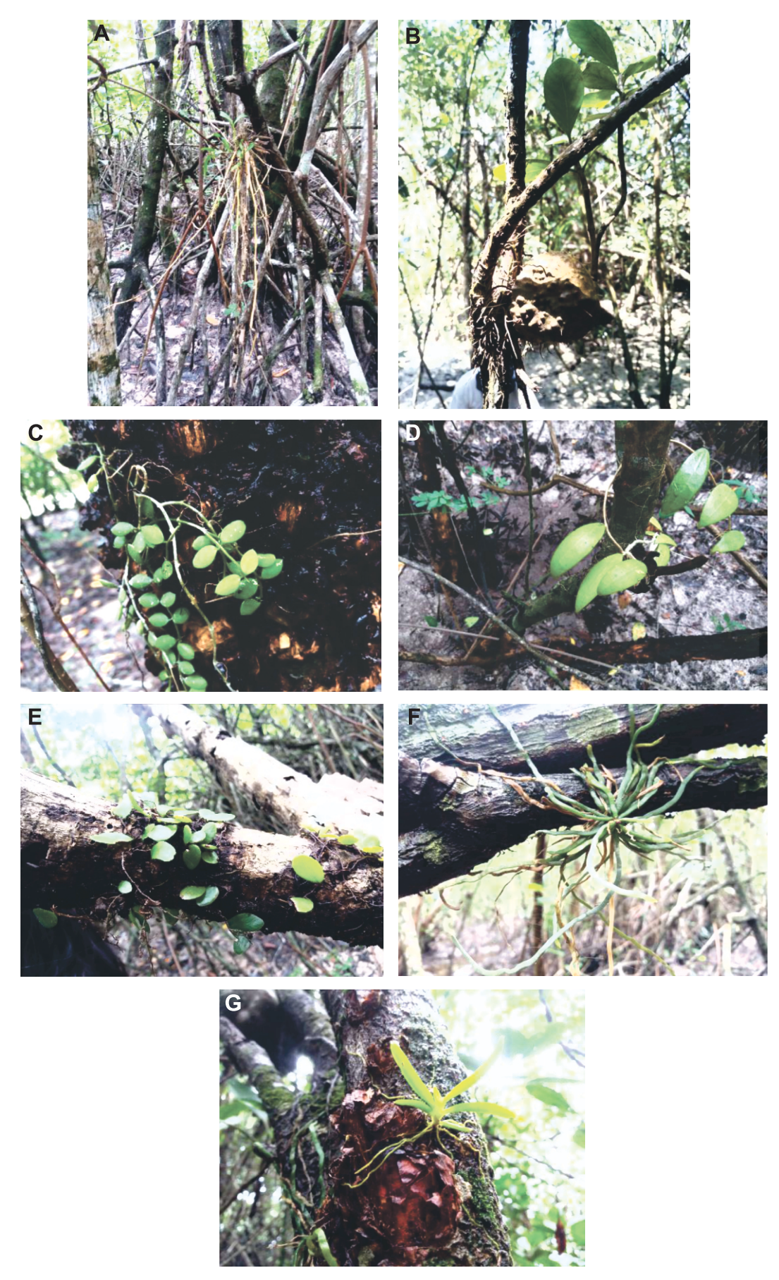
Figure 2 Photos of vascular epiphytes found in Pulau Telaga Tujuh, Terangganu Notes: A = Dendrobium cruminatum; B = Hydnophytum formicarum; C = Dischidia nummularia; D = Hoya verticillata; E = Pyrrosia piloselloides; F = Taeniophyllum glandulosum; G = Dendrobium sp.