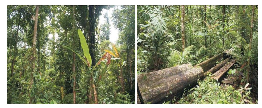
Figure 3. Open forest after logging

In this habitat type the process of secondary succession is clearly visible. Due to selective logging several trees with big diameter are still present. It is represented by three plant communities, the community of Musa paradisiaca and Callamus longipina , the community of Diospyros hebecarpa-Lepinopsis ternatensis and the Smilax malacensis-Pandanus tectorius community (Fig. 3).