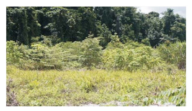
Figure 2. Transition between river bank grassland and real forest

This forest type appears to be one of the main habitat types of D. muelleri due to the low human pressure and its importance as a feeding habitat. More than 5 individuals of forest wallaby were spotted and their dung and trails were observed. In average 12 (7-20) food plant species were found with a mean cover of 2.5 %.