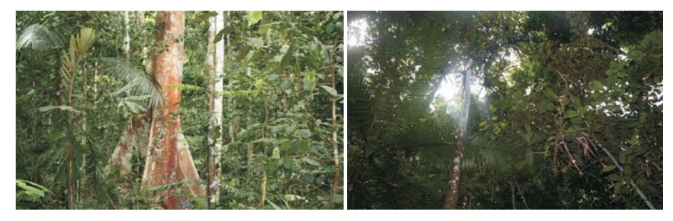
Figure 4. Undisturbed("Primary") forest, one of habitat of wallaby

This habitat is represented by the community of Sommeria leucophylaa-Paraltropis glabra which is differentiated by Sommieria leucophylla, Alpinia sp., Paraltropis glabra, Buchanania arborescens, Adina sp., Garcinia latisima, Garcinia sp., Orania palindan, Pterocarpus indicus, Ficus benyamina, Intsia bijuga, Anthocepalus chinensis, Paracroton pendulous, Licuala sp., Parasarianthes falcataria, Baringtonia sp., Eudia sp., Hernandia ovigera, Poponia sp., Ficus pincorhiza, Alleuritis molucanna and Gymnacantera farcubariana.