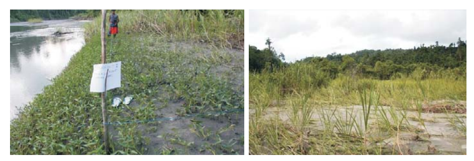
Figure 1. Typical river bank grassland consisting of sparse thicket, grasses and herbs.

This habitat (Fig. 1) is mainly used by the forest wallaby as feeding area, but also for shelter and to drink and play. Trails and food remains were found of two individuals.