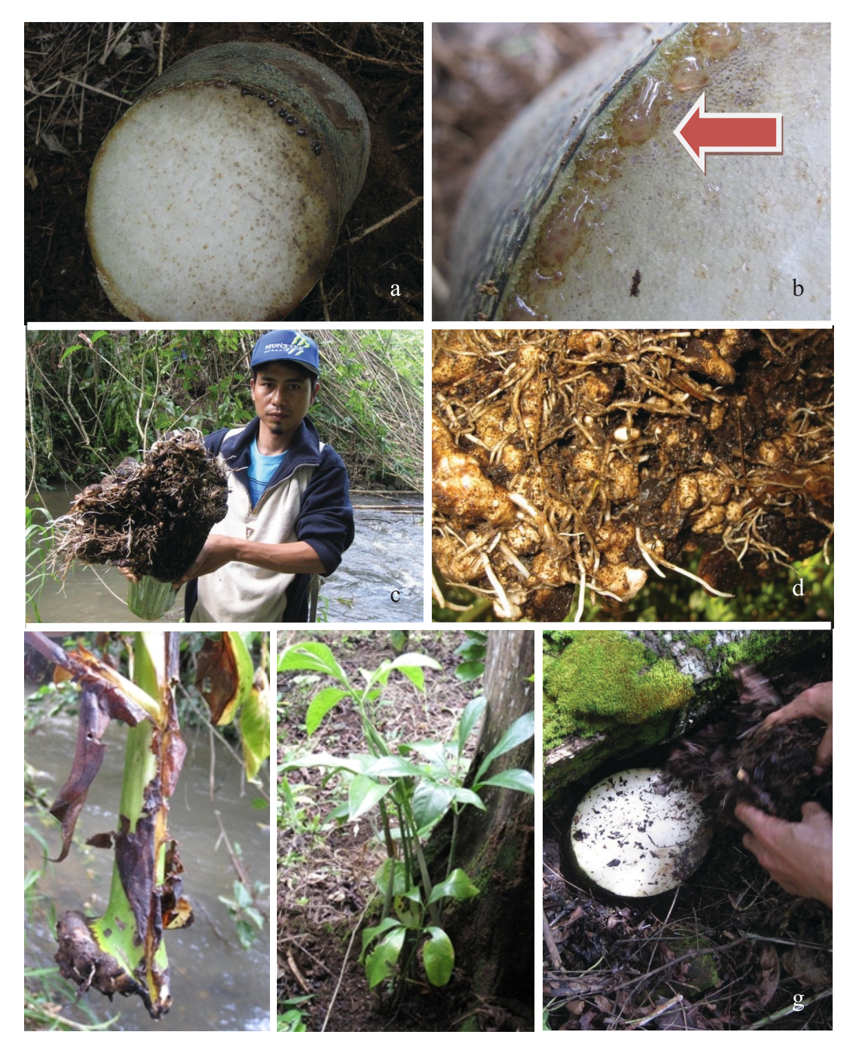
Figure 2 Petiole cross section (a); Exudate from the petiole (b); A part of a petiole forming callus naturally (c); Callus appears with roots (d); Part of a rachis forming a callus (e); Seedling growth from a piece of planted petiole in the forest (f); A chopped section of petiole planted in the forest by a conservation-minded local community member (g)

roots naturally (Taiz & Zeiger 2010). Sometimes the plant can also produce both auxin and cytokinin in the leaves as well in the roots (Srivastava 2002). Therefore, when the petiole is cut, the transportation of cytokinin from the roots to the shoots is suddently stopped but the