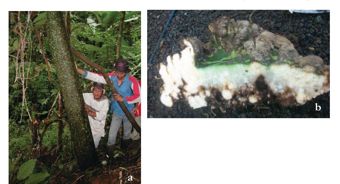
Figure 4 The petiole of A. titanum resembling a tree trunk in its natural habitat (a), cross section of a part of a petiole forming calluses initiated from the epidermis (b)

The petiole of A. titanum resembles a tree trunk and its anatomy is typical of monocot stems (Fig. 4a). In appropriate condition, chopped petiole of A. titanum developed ex vitro calluses naturally, which can be used as propagation material. This is supported by totipotency theory that one cell can grow and develop to be a new