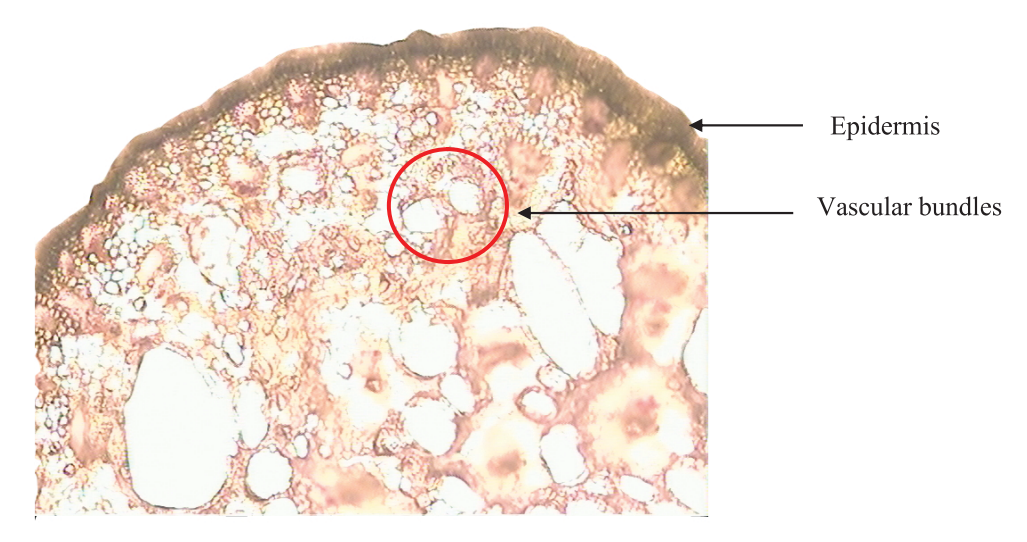
Figure 3 Cross section of petiole from the seedling of Amorphophallus titanum (40 X) using light microscope; the emergence of the callus is probably initiated from the epidermis of the damage petiole zone

covering the entire damage petiole surface irregularly. The appearance of the callus is probably initiated from the epidermis of the damage petiole zone (Fig. 3).