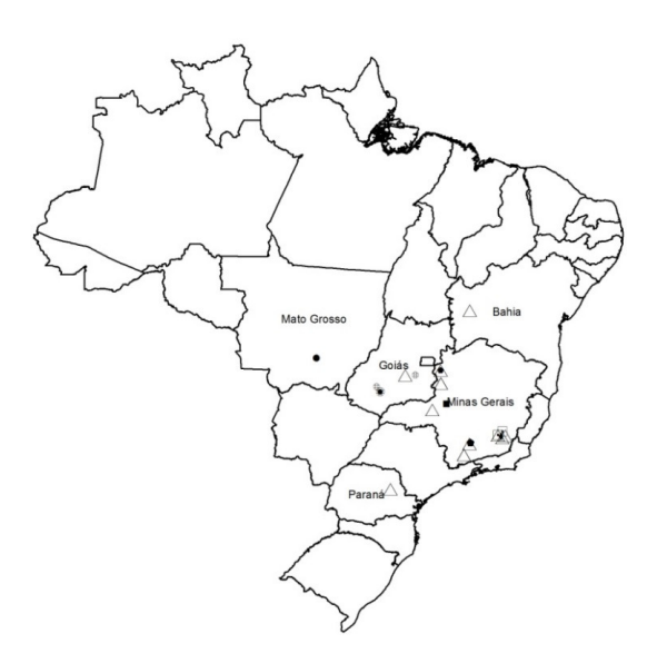
Figure 2. Associated of mycelial compatibility groups (♦ MCG 1, ● MCG 2, △ MCG 3, ■ MCG 4, ● MCG 5, ⊕ MCG 6 and □ MCG 7) with locations of S. sclerotiorum isolate collections from bean field in 5 states in Brazil.

The aggressiveness ratings of 25 isolates, contained isolates that were significantly different from each other (P=0.0002) (Table 2) and there were no significant differences due to blocking (P=0.1186). The coefficient of variation (CV) was 21.78%. The straw test rating means per isolate on cultivar G122 ranged from 6.6 to 4.1. The aggressive isolates formed three different groups: the first was composed of isolates from Unaí (61B and 56F), Ventania (57A), Porto Firme (71A, 71B and 52C), Rio Verde (54C and 51C), Coimbra (67A), Montividiu (25), Canãa (65B), Lavras (63F), Patos de Minas (70B), Paracatu (53B), Iraí de Minas (60A) and Lambari (58C); the second group was made up of isolates from Silvânia (17), Ijací (40), Paracatu (53C), Lambari (43), Oratórios (66E) and Campo Verde (26) isolates; and the third group contained only the Goiânia (69C), São Desidério (10) and Viçosa (64D) isolates. Most of the isolates were classified as having intermediate aggressiveness, however there were significant differences among them.