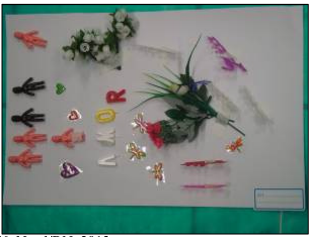
Figure 1. Poster built by NT6, Natal/RN, 2013.

The representations built by NT6 (Figure 1) summarise the benefits cited in unanimity by citizens of the research: to guarantee a humanescent care.