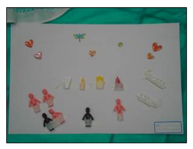
Figure 3: Poster built by NT1, Natal/RN, 2013.

To this end, improvement needs were referred to, which are synthesized in the poster of NT1 (Figure 3).