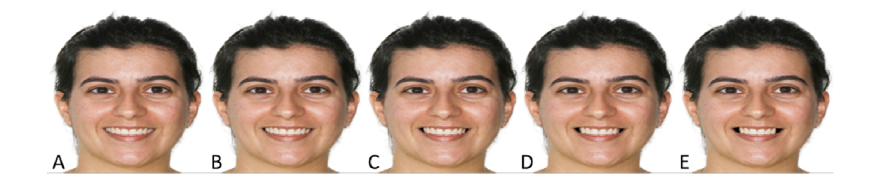
Figure 1. Set of five different full smiles in a subject with a short face. A) narrow, 30% buccal corridor. B) medium-narrow, 20% buccal corridor. C) medium, 15% buccal corridor. D) medium-wide, 10% buccal corridor. E) wide, 0% buccal corridor.

Five images of each facial type were obtained from the absence of buccal corridor to growing presence in the manipulated images (Figures 1 to 3).