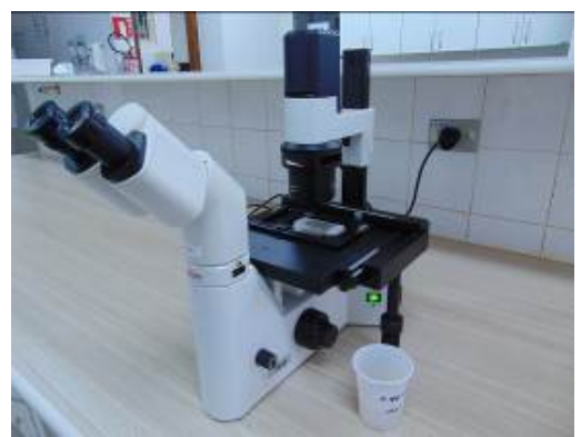
Figure 2. Counting of nematodes in suspension solution with the aid of a Peters' chamber under an inverted light microscope to observe bacterial endospores.

presence or absence of endospores of the bacterium attached to the nematode's cuticle (Figure 2). Subsequently, the percentage of nematodes showing bacteria attached to its body in relation to the total number of nematodes observed in the suspension was calculated.