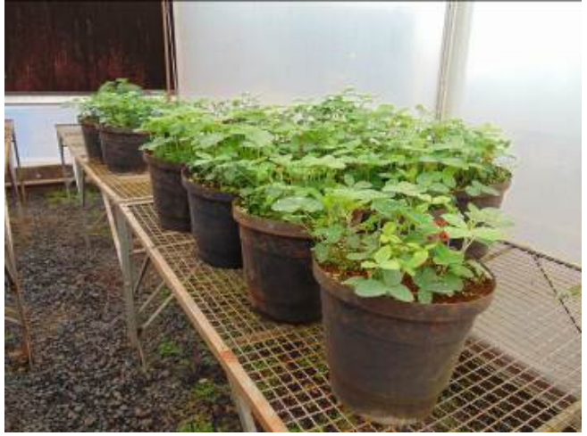
Figure 1. Populations of Heterodera glycines originated from field soil samples, being multiplied and preserved under greenhouse conditions.

A soil aliquot of 150 cm<sup>3</sup> was obtained 28 days after sowing and then processed by the centrifugal flotation in sucrose solution technique, according Jenkins (1964).