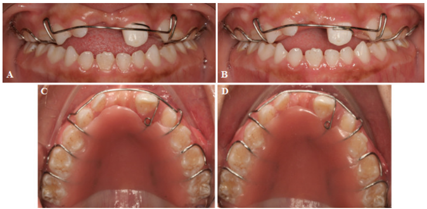
Figure 5. Plate with coil spring to move tooth 21 mesially: A and B – Frontal photographs before and after spring action, C and D – Upper occlusal photographs before and after spring action.