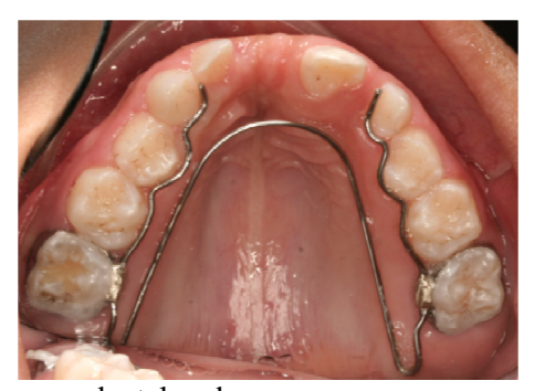
Figure 4. Porter arch to expand the upper dental arch

MLLI, which was missing (Figure 5); and other removable appliance with a finger spring – activated for two months – to correct the anterior crossbite of the MLCI (Figure 6). This latter appliance had two stock teeth to replace the maxillary right central incisor and MLLI, restoring aesthetics and function.