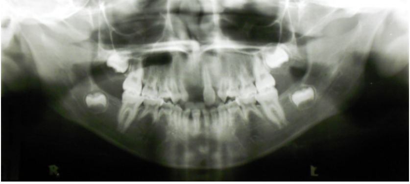
Figure 3. Initial panoramic radiograph.

Treatment consisted in placing a Porter arch (Figure 4) – activated for six months – to correct the atresia in the maxillary arch; placing a removable appliance with a coil spring – activated for seven months – to move the MLCI mesially, correct the midline and create space for replacement of the