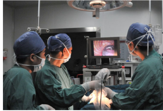
Figure 4. VATS surgical procedure