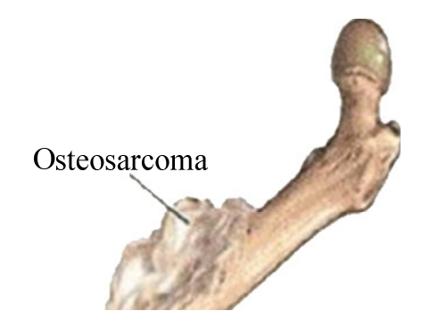
Figure 1. Schematic diagram of osteosarcoma

pneumothorax that affects prognostic effect and reduces patients' quality of life (ZHANG et al., 2011; YE et al., 2012). According to the existing data analysis, there is no clear final conclusion for spontaneous pneumothorax pathology of lung cancer patients. But through VATS, pathogenesis of patients' spontaneous pneumothorax can be inferred, which provides reference and suggestion for clinical treatment in improving patients' prognostic outcomes and quality of life.