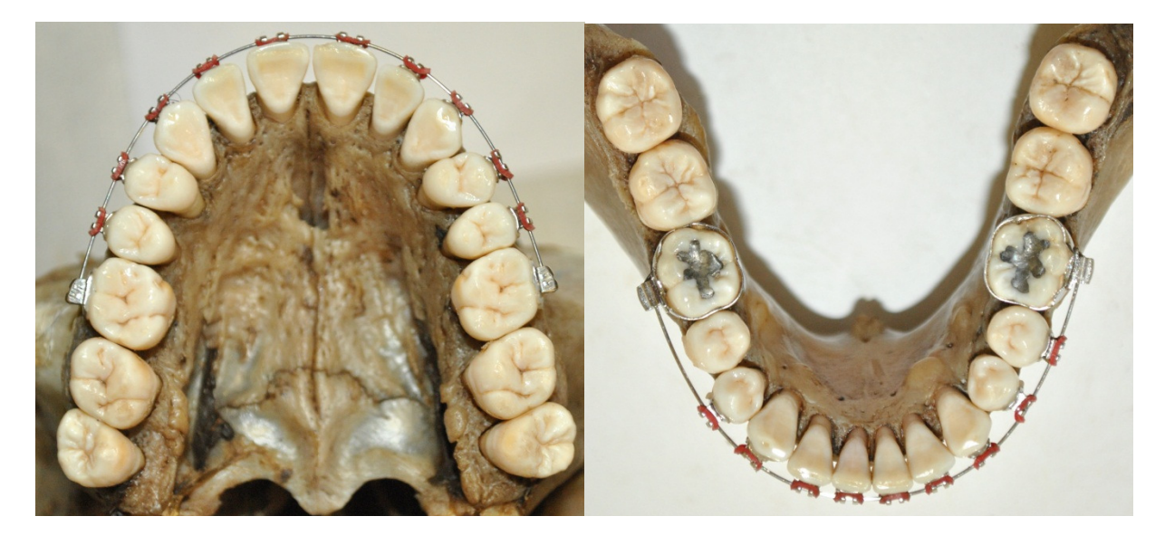
Figure 1. Postmortem (PM) occlusal view of the maxilla and mandible.

It is important to note that devices and facilities for the PM radiographic examination were temporarily unavailable in the local medico-legal institute. Radiographic exams could be performed in private clinics. However, performing such exams out of the forensic services would delay the identification process and increase the respective costs. Based on that, the positive human identification was founded on the comparison of photographic dental data (Figure 3). This decision was taken especially because the identifiers detected in the photographic records were distinctive enough to support the case. Discrepancies (explainable or not) were not observed between AM and PM data.