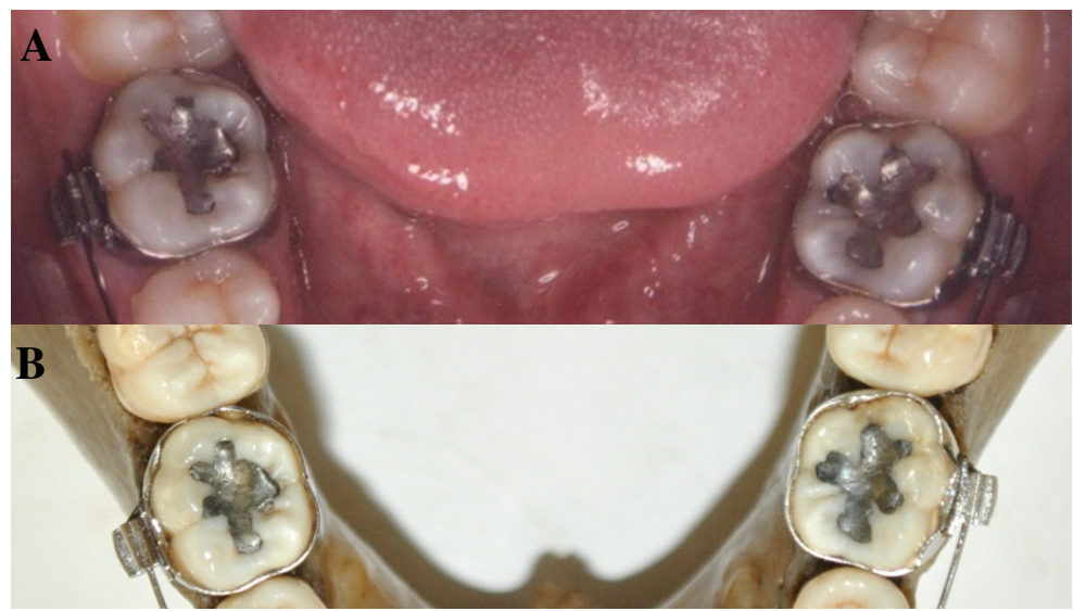
Figure 3. Photographic matching of the amalgam restorations observed in the lower first molars antemortem (A) and postmortem (B).