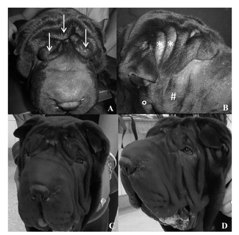
Figure 1. Photographs of male Shar-pei, cranial view (A) and right lateral (B) of the head, revealing facial folds in supraorbital regions (arrows), zygomatic (*), masseteric (#) and side of the neck (°), obstructing visual axis. In (C) cranial view, in (D) left side view, 12 months after rhytidectomy in archs and use of modified walking suture.

The evaluation of the hematimetric indexes and biochemical profile performed in the preoperative period were within the normal range for the species.