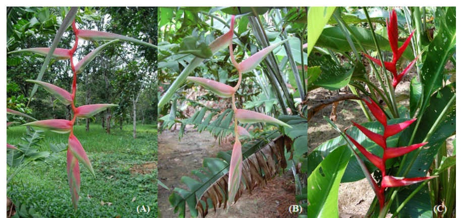
Figure 2. Inflorescences of H. chartacea var. Sexy Pink resulting from an in vitro polyploidy induction assay by somatic doubling using colchicine. (A) 29 Genotype; (B) 32 Genotype; (C) 35 Genotype.

There was no presence of hairiness in the pseudo stem in any of the genotypes. The presence of hairs is an important characteristic in the production of heliconia, especially an excess, because it has a negative effect on post-harvest handling and transport that requires additional cleaning, because the presence of hairs leads to the retention of debris (CASTRO et al., 2007).