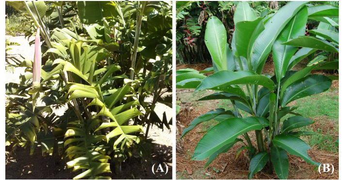
Figure 3. Changes in leaf limb of H. chartacea var. Sexy Pink resulting from an in vitro polyploidy induction assay by somatic doubling using colchicine. (A) Genotype 12, (B) Genotype 35.

3). The presence of wax on the upper and lower surfaces of the leaf blade was also observed exclusively in the individuals of this genotype, which gives them extra protection against water loss from transpiration.