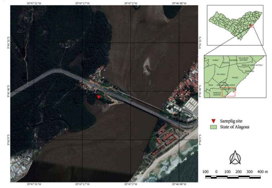
Figure 1. Map displaying the study area and sampling site in the MMELC.

Two mangrove forest areas were chosen in metropolitan region of Maceió. The first studied area is located at the Mundaú-Manguaba estuary lagoon complex (MMELC) (9°69"66'S and 35°78"57.87'W) (Figure 1). The second area is located near the mouth of the Meirim River (9°30"26' S and 35°37"14'W) (Figure 2).