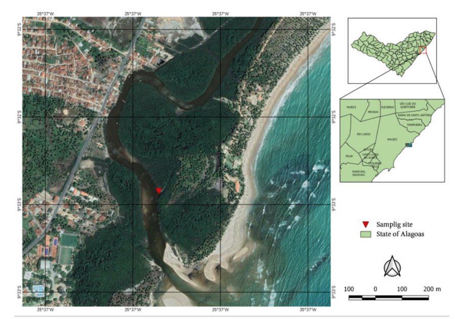
Figure 2. Map displaying the study area and sampling site in the Meirim River.

Figure 1. Map displaying the study area and sampling site in the MMELC.