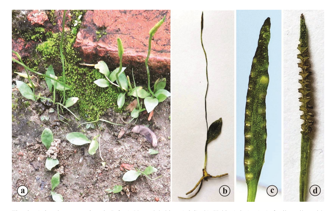
Fig. 2. Ophioglossum nudicaule L.f. a) Natural habitat ( \times 0.3), b) Habit ( \times 0.6), c) A fertile spike with sporangia and spores ( \times 5), d) A spike without spore ( \times 4).

Representative specimens examined: Bagerhat: Sharankhola, Katka, 19.08.2019, G.M. Hossain 0249 (JUH); Barguna: Taltoli, Tengragiri, 05.09.2022, G.M. Hossain 5892 (JUH).