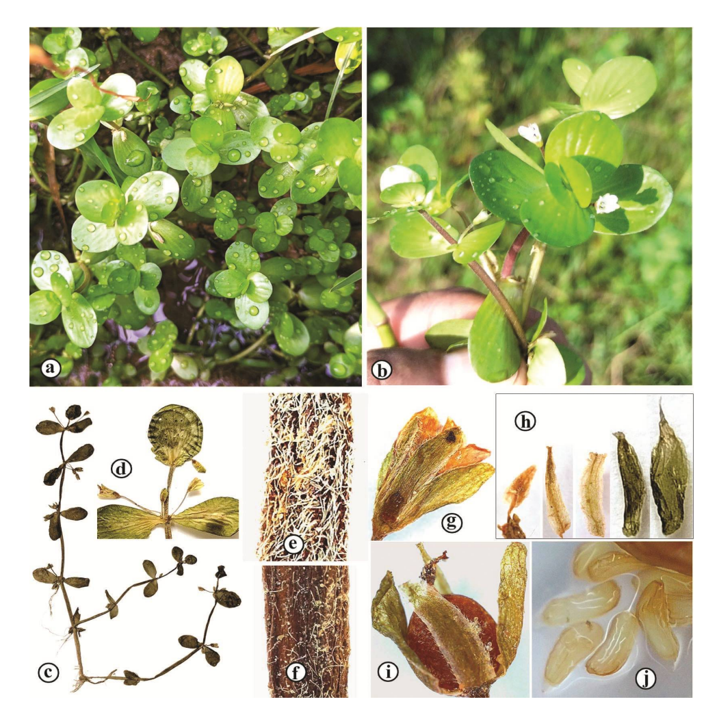
Fig. 3. Bacopa australis V.C. Souza. a) Natural habitat (×0.45), b) Habit with flowering branches (fresh) (×0.75), c) Whole plant (dry sample) (×0.25), d) Flowering branch (dry) (×0.75), e) Dense hairs on apical internode (×15), f) Sparse hairs on median internode (×15), g) A flower (dry) (×4), h) Calyx (×5), i) A fruit with persistent calyx (×4), j) Seeds (×30).

Bacopa australis V.C. Souza., Acta Bot. Bras. 15(1): 58 (2001). Type: Brazil. Paraná. Capanema, río Iguazú, J. Lindeman & H. Haas 3358 (HT: MBM!, IT: K!). (Fig. 3)