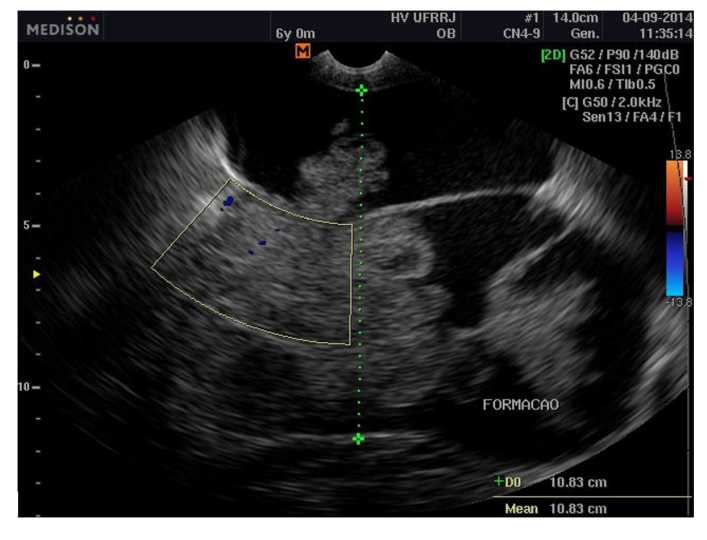
Figure 1. Cystic and vascular formation in the right kidney.

An abdominal ultrasound showed a vascularized formation with no defined limits and probable origin in the left kidney, and a dislocated liver and spleen (with no changes) (Figure 1). The initial complete blood count revealed lymphopenia; all other indicators were within normal limits (i.e., albumin, urea, creatinine, alkaline phosphatase and aspartate aminotransferase). A chest X-ray image showed no signs of metastasis.