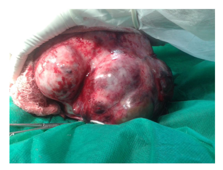
Figure 2. Surgical resection and macroscopic appearance of the right kidney.

Limited data exist on the prognosis of dogs with nephroblastoma. In one study, dogs with extrarenal nephroblastoma (string spinel) that underwent surgical treatment and radiotherapy lived for 374 days on average; those receiving average palliative treatment survived only 55 days (Liebel et al., 2011).