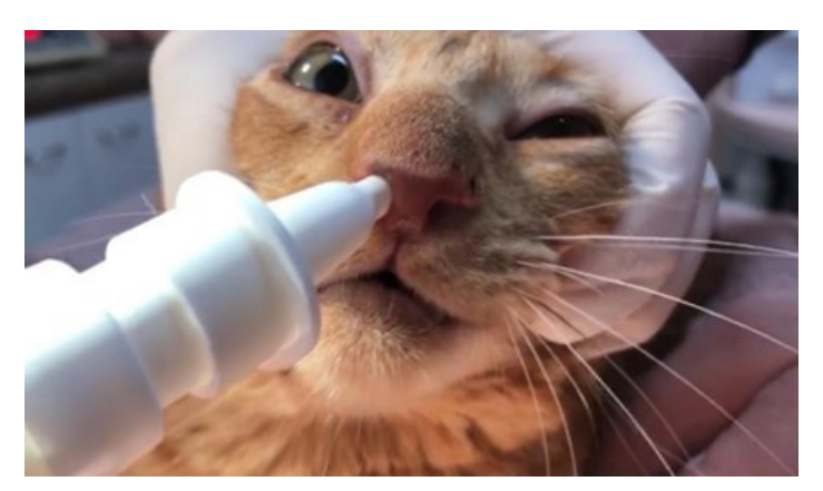
Figure 1. Feline sporotrichosis patient (case 7) receiving intranasal administration of 1% clotrimazole spray through its nostril. The infusion was performed by introducing the applicator tip through each one of the nostrils and pulling the valve one time per nostril (volume infused equivalent to 1 mL/nostril).

This case series is based on the medical records of cats presented to the Feline Medicine Service at the Veterinary Hospital from the Universidade Federal Rural do Rio de Janeiro-UFRRJ (Seropédica-Rio de Janeiro) between 2018 and 2021 with nasal sporotrichosis (lesions extending from the nasal bridge to the intern mucosa). Included cases were those with a confirmatory diagnosis that was reached by fungal culture (± other laboratory tests such as cytology and serology); the veterinarian in charge prescribed an intranasal infusion of clotrimazole spray (1% clotrimazole in sodium chloride solution; Grupo TudoDVet Farmácia Veterinária <sup>*</sup>; one spray in each nostril at approximately 1 mL per nostril, SID) (Figure 1) as adjunctive therapy to per os itraconazole (100 mg/cat PO SID); with follow-up records of a minimum of 30 days from the beginning of drug usage; and with posttreatment follow-up evaluation times. In all cases, written consent was obtained from the owner.