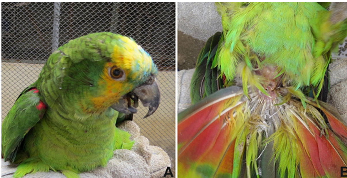
Figure 1. Blue-fronted Amazon parrot. Clinical Coccidiosis (A); greenish watery diarrhea with fecal debris adhered on the cloacae surrounding feathers (B).