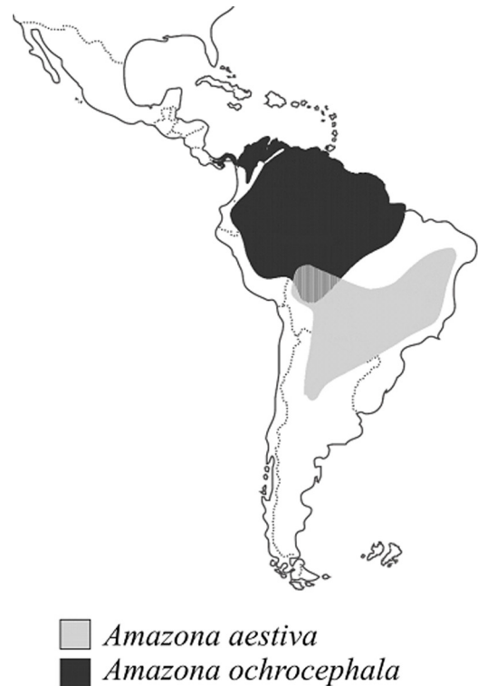
Figure 3. Geographic range of both parrots in Brazilian territory, according to (IUCN, 2013).

Acknowledgements. We are thankful to the CETAS/IBAMA located at Municipality of Seropédica