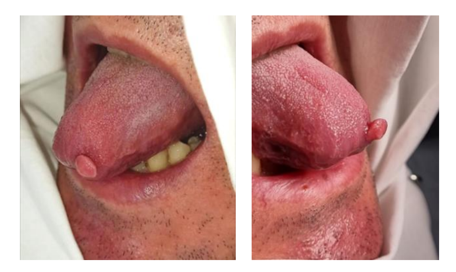
Fig. 1 Oral papilloma located on the dorsum of the lingual organ at the apex