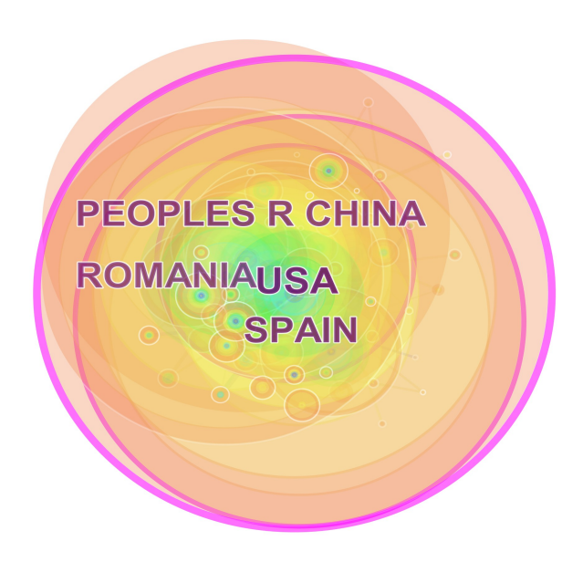
Figure 2. Country publication network

Looking at Figure 2, one can intuitively say that the first four countries involved in MOOC/eLearning phenomena are United States, Spain, China and Romania. This is also proven by data in Table.3. The bigger the node is represented within the Figure, the more productive the country is. When assessing the numeric results, it is interesting to conclude that the first 5 countries published 46% out of the entire released academic production.