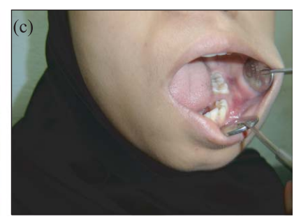
Fig.1: Preoperative view of the patient with close (a) & open (b) (c) mouth.