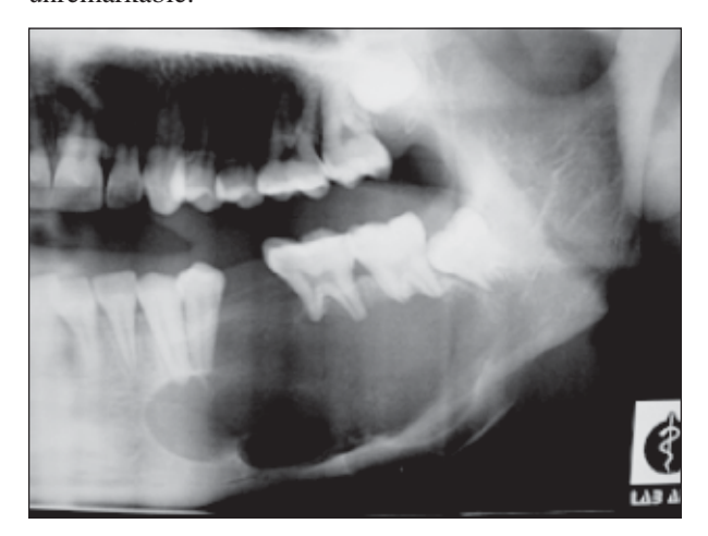
Fig.-2: Preoperative Orthopantamogram

The lesion was non-tender and there was no regional lymphadenopathy with no motor or sensory functional deficit. She was otherwise fit and was not medically compromised. On examination the size of the lesion was 7.5cm X 4cm, extended from left lateral incisor to 3rd molar of mandible. Cortical expansion was marked on the buccal side but lingual expansion of the cortex was minimal. There was no intra oral or extra oral persistent sinus or discharge. The remainder of the oral cavity was unremarkable.