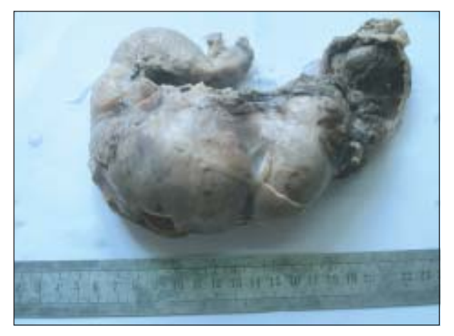
Fig.-1: Gross view of the resected intestine

The surgical specimen was sent to the Department of Pathology, BSMMU with a provisional diagnosis of intestinal tuberculosis.On gross examination there was a long loop of intestine measuring 26 cm in length. Central portion of the loop was dilated measuring 10 cm in diameter (Fig.-1), located 10cm from the proximal resection margin