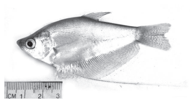
Figure 1. General characteristic of Moonlight Gourami, Trichopo dus microlepis (Perciformes, Osphronemidae).

Ten male and ten female specimens of T. micro-lepis (Fig. 1) were obtained from the Chao Phraya River, Sing Buri Province, the central part of Thailand and the Mekong Basin, Nong Khai Province, Northeast of Thailand. Chromosomes were directly prepared in vivo as follows by Supiwong et al. (2013, 2017). Conventional staining was performed using 20% Giemsa's solution for 30 min (Rooney 2001). Ag-NOR banding was carried out following by Howell and Black (1980) and C-banding was performed following from the method of Sumner et al. (1972).