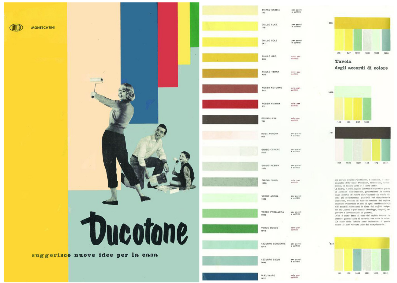
Figure 6 - Ducotone. Advertising

Ponti integrated the technological evolution in the design process. Flipping through the pages of "Stile", the attention to colour as an economic aesthetic device is evident even in the advertisements, which promoted new products highlighting the interest of architecture in innovative plasters and wall paintings. During