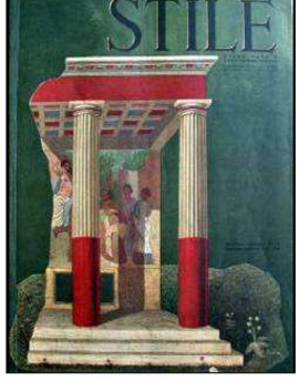
n. 16, April 1942