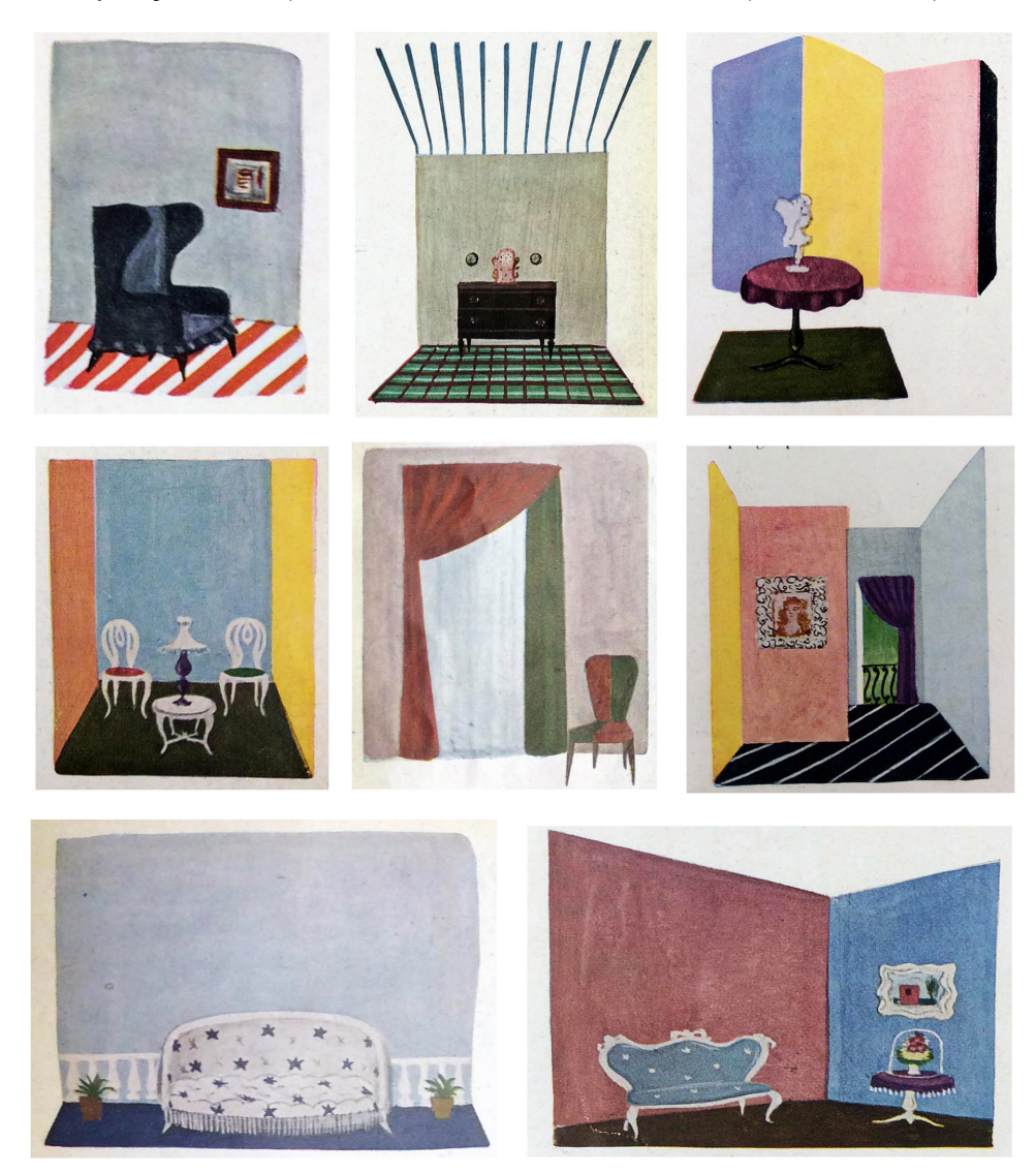
Figure 5 - Color and patterns. Study of the relationship between the walls and the furnishing elements (from "The house coloured by new textiles", Stile, 1941, n. 11).

"Se noi siamo sempre dichiaratamente per la casa colorata, anzi vivamente colorata, noi lo siamo ora per un'altra ragione e per altri colori. Siamo per la casa colorata perché