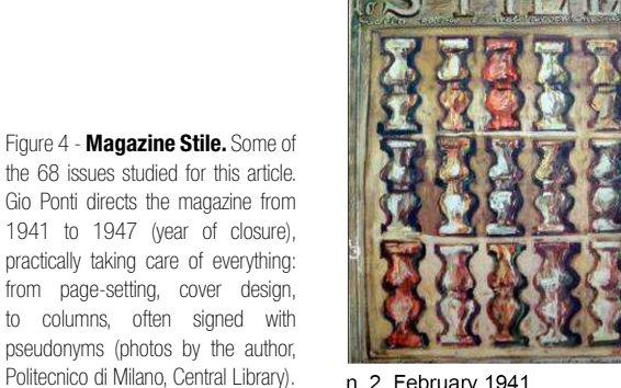
n. 2, February 1941