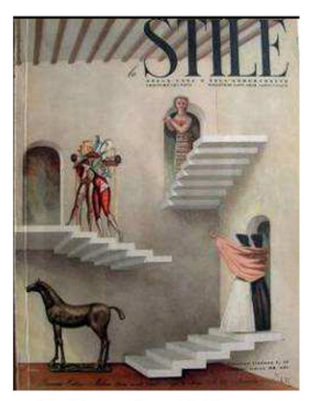
n. 23. November 1942

Between the two writings of 1933 and 1957, there is the happy parenthesis of "Stile", characterized by an elegant graphic image, lightened by fresh drawings and with colour accompanying the illustrations (Figure 3). The magazine differs from its competitors for its cultural approach, open to costume and other arts: painting, sculpture, cinema, but also cooking, gardening, table equipment, literature and music. Moreover, and above all, it differs for the fact that it addressed ladies. Ponti recognized the latter's intellectual vivacity and cultural interest superior to that of their husbands, prompting them to take charge