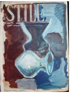
n. 1, January 1941