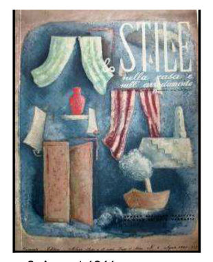
n. 8, August 1941

widen distances and create discomfort, because the limits of the walls are imperceptible and one feels lost like on the pack. He also advised for the floor and the ceiling not to be both light or dark, suggesting "a direction from light to dark": a black floor is a lake on which things float, while a light floor supports them; a coloured linoleum floor is like a lawn and requires a light ceiling. Architecture is achromatic, but its interior lives through colour. (Ponti 1957)