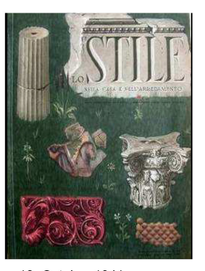
n. 10, October 1941