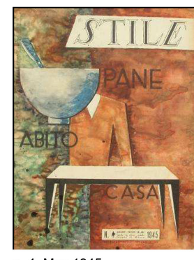
n. 4, May 1945