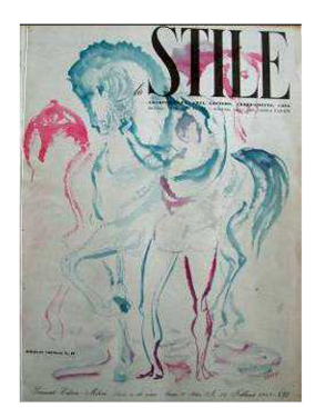
n. 26, February 1943

well-orchestrated play of colours, in which also the ceiling participates. Indeed, for the latter, he suggested striking colours, while proposing very light colours in the entrances and corridors and fresh and energetic colours in the rooms, inviting readers to dare bold combinations. For studios and small rooms, he recommended intense colours, while for the kitchens blue and yellow. The result is a different colour for each room, where the combinations between the different rooms offer a harmonious composition like the palette of a painting. A very similar scheme, with only six colours and six elements, had already appeared in "Domus" (Figure 4) (Ponti 1933). Years later he returned to the use of colour in interiors design in his considerations published in "Amate l'architettura," claiming that a white ceiling is a void and needs to be closed by coloured walls, and accentuated by an intense coloured floor. The ceiling covers the room like a lid, it is its sky. Therefore, it can be dark, intense and ornate, because it becomes a page to read while fantasizing. The sky closes in, while fog or snow