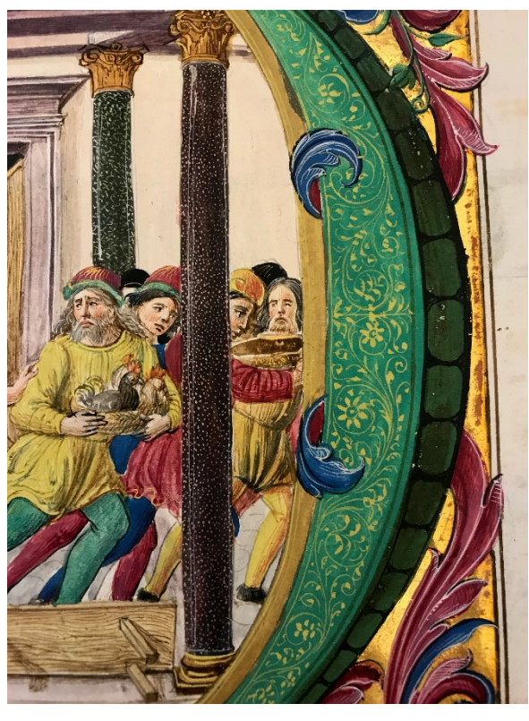
Fig. 16: Attavante degli Attavanti, The Cleansing of the Temple, f. 56v, Ms. Cor. Laur. 4 (mm 700x500), color on parchment, 1505-6, Firenze, Biblioteca Medicea Laurenziana, detail, © Photograph taken by the author, with a special permission from the MiBAC. Any further reproduction by any means is strictly prohibited