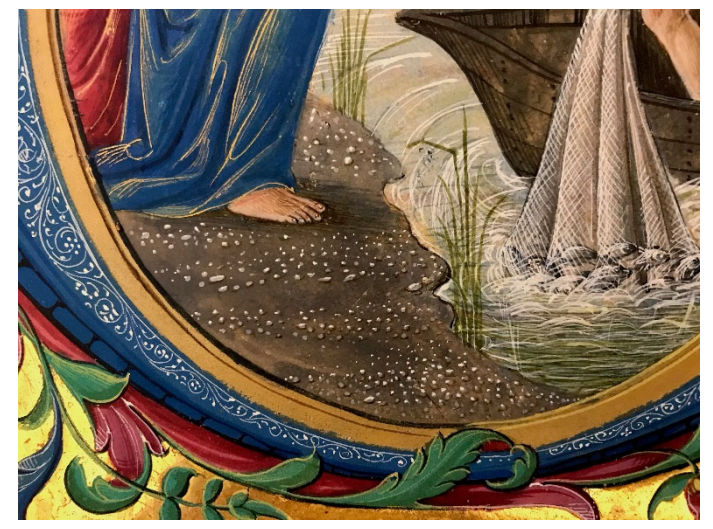
Fig. 9: Attavante degli Attavanti, The Call of Peter, f. 33v, Ms. Cor. Laur. 4 (mm 700x500), color on parchment, 1505-6, Firenze, Biblioteca Medicea Laurenziana, detail, © Photograph taken by the author, with a special permission from the MiBAC. Any further reproduction by any means is strictly prohibited