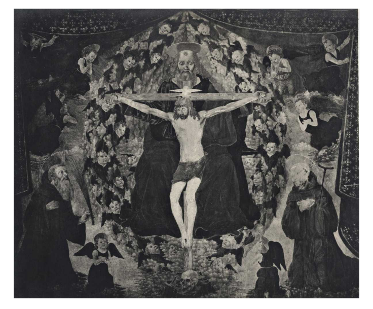
Fig. 7: Alesso Baldovinetti, The Holy Trinity and the Saints Benedetto and Giovanni Gualberto, 1469-71, tempera on panel, Firenze, Galleria dell'Accademia