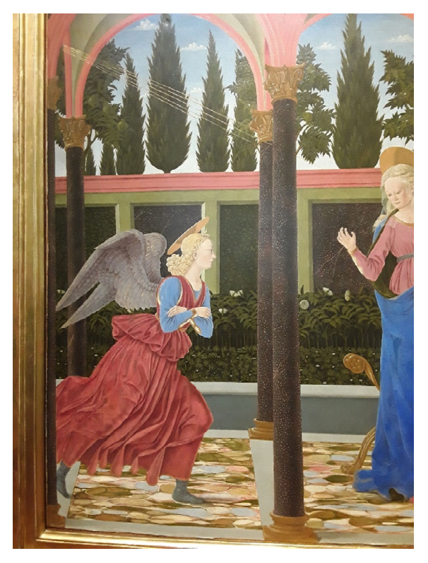
Fig. 15: Alessio Baldovinetti, Annunciation, about 1457, tempera on oak board, Firenze, Galleria degli Uffizi, detail, © Photograph taken by the author