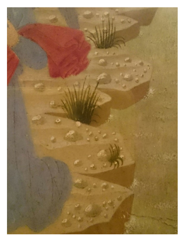
Fig. 3: Alesso Baldovinetti, The Baptism of Christ (from Fra Angelico, The Silver Chest), 1450-52, tempera and gold leaf on panel, Firenze, Museo di San Marco, detail, © Photograph taken by the author