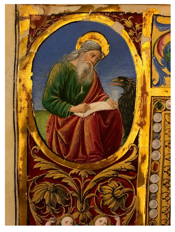
Fig. 17: Attavante degli Attavanti, Prophet, f. 1v, Ms. Cor. Laur. 4 (mm 700x500), color on parchment, 1505-6, Firenze, Biblioteca Medicea Laurenziana, detail, © Photograph taken by the author, with a special permission from the MiBAC. Any further reproduction by any means is strictly prohibited