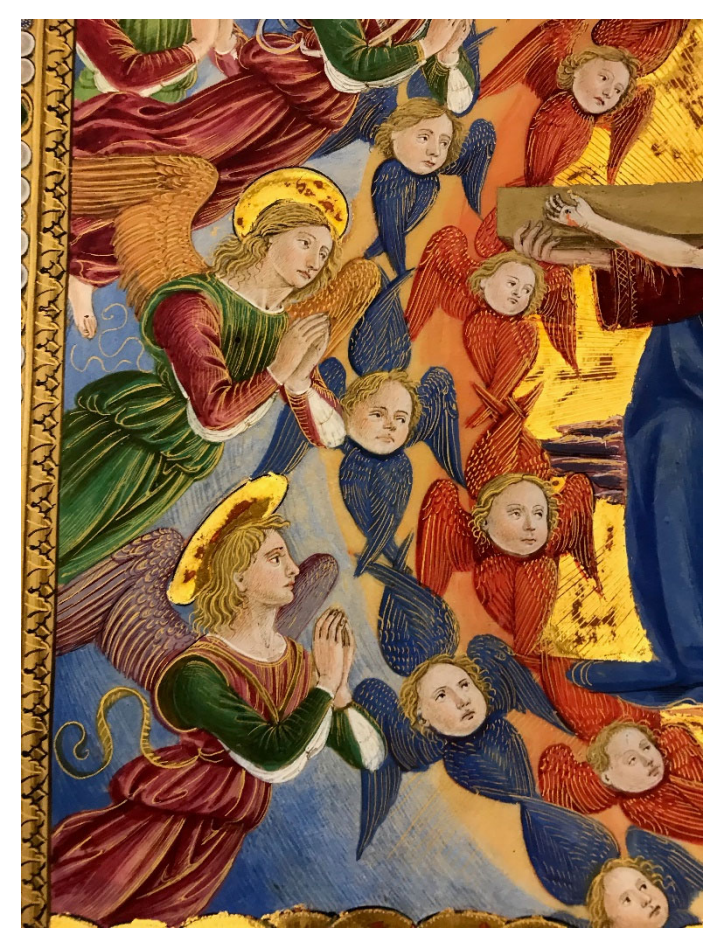
Fig. 8: Attavante degli Attavanti, The Holy Trinity, f. 1v, Ms. Cor. Laur. 4 (mm 700x500), color on parchment, 1505-6, Firenze, Biblioteca Medicea Laurenziana, detail, © Photograph taken by the author, with a special permission from the MiBAC. Any further reproduction by any means is strictly prohibited