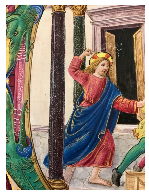
Fig. 14: Attavante degli Attavanti, The Cleansing of the Temple, f. 56v, Ms. Cor. Laur. 4 (mm 700x500), color on parchment, 1505-6, Firenze, Biblioteca Medicea Laurenziana, detail, © Photograph taken by the author, with a special permission from the MiBAC. Any further reproduction by any means is strictly prohibited