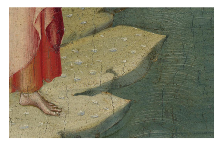
Fig. 11: Giovanni di Paolo, The Baptism of Christ (from the "Butler" predella), 1454, egg tempera on wood, London, National Gallery, detail