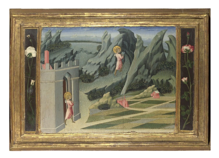
Fig. 2: Giovanni di Paolo, Entering of St. John the Baptist into the Wilderness (from the "Butler" predella), 1454, egg tempera on wood, London, National Gallery, © The National Gallery, London