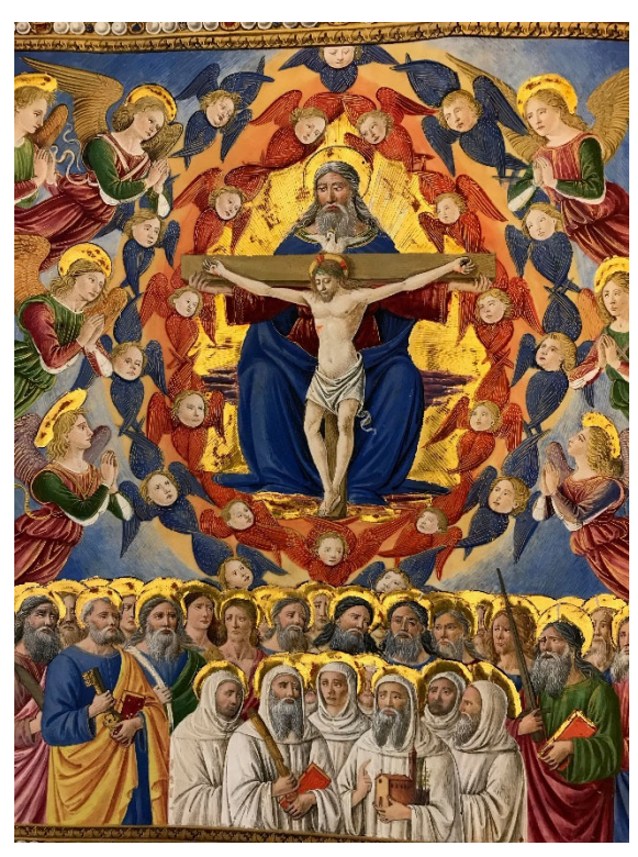
Fig. 6: Attavante degli Attavanti, The Holy Trinity, f. 1v, Ms. Cor. Laur. 4 (mm 700x500), color on parchment, 1505-6, Firenze, Biblioteca Medicea Laurenziana, detail, © Photograph taken by the author, with a special permission from the MiBAC. Any further reproduction by any means is strictly prohibited