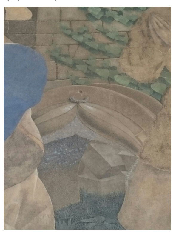
Fig. 4: Alesso Baldovinetti, The Nativity, 1460-62, mural painting, Firenze, Cloister "dei Voti", Chiesa della Santissima Annunziata, detail, © Photograph taken by the author