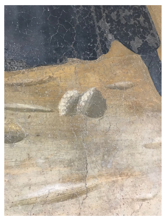
Fig. 18: João Goncalves, Episodes from the Life of St. Benedict, 1436-39, mural painting, Firenze, Badia Fiorentina, Chiostro "degli Aranci", detail of the western wall, © Photograph taken by the author