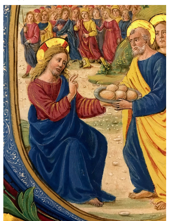
Fig. 10: Attavante degli Attavanti, The Feeding of the Moltitude, f. 43v, Ms. Cor. Laur. 4 (mm 700x500), color on parchment, 1505-6, Firenze, Biblioteca Medicea Laurenziana, detail, © Photograph taken by the author, with a special permission from the MiBAC. Any further reproduction by any means is strictly prohibited