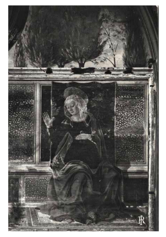
Fig. 13: Alesso Baldovinetti, The Annunciation, 1466-68, mural painting, Firenze, Cappella del Cardinale del Portogallo, Basilica di San Miniato al Monte, detail, © Fototeca della Fondazione Zeri, Bologna