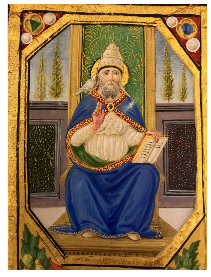
Fig. 12: Attavante degli Attavanti, The Procession, f. 7v, Ms. Cor. Laur. 4 (mm 700x500), color on parchment, 1505-6, Firenze, Biblioteca Medicea Laurenziana, detail, © Photograph taken by the author, with a special permission from the MiBAC. Any further reproduction by any means is strictly prohibited