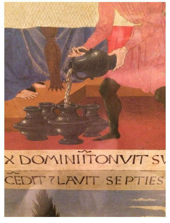
Fig. 5: Alesso Baldovinetti, The Feast at Cana (from Fra Angelico, Silver Chest), 1450-52, tempera and gold leaf on panel, Firenze, Museo di San Marco, detail, © Photograph taken by the author