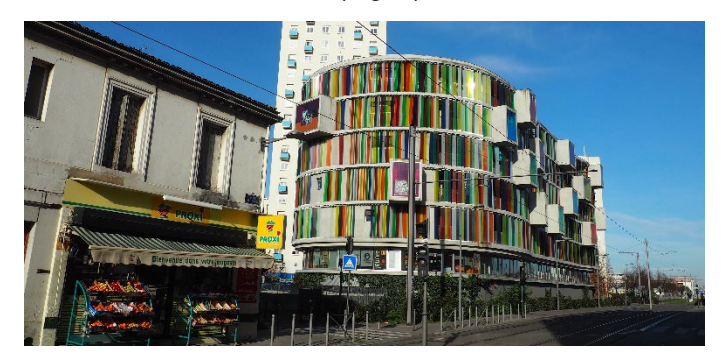
Fig. 7. Arc-en-Ciel building.

Finally, the Arc-en-Ciel Building, designed by the architect Bernard Bühler, is also located at the edges of different sections of the city, between the city of stone and some of the new urban ensembles (Fig. 7).