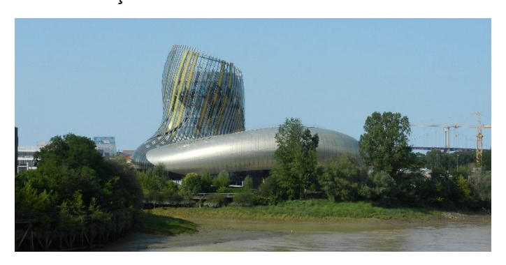
Fig. 4. Cité du Vin.

Architects are rational in justifying their choice of colors for a project. This was the case for the wine museum Cité du Vin (2016) designed by Agence XTU (Fig. 4), whose "golden highlights evoke the blond (golden) stone of the Bordeaux façades."