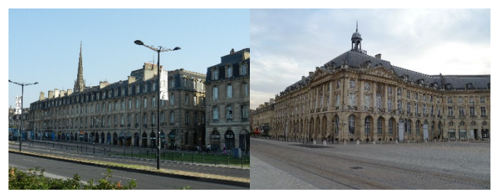
Fig. 2. Bordeaux, city of stone.

Then, the façade coatings from the 14th to the 19th centuries, as well as natural or varnished brick introduced by the Art Nouveau and Art Deco movements of the early 20th century, led to the colors of Bordeaux, in a city of stone mostly built in the 17th, 18th and early 19th centuries.