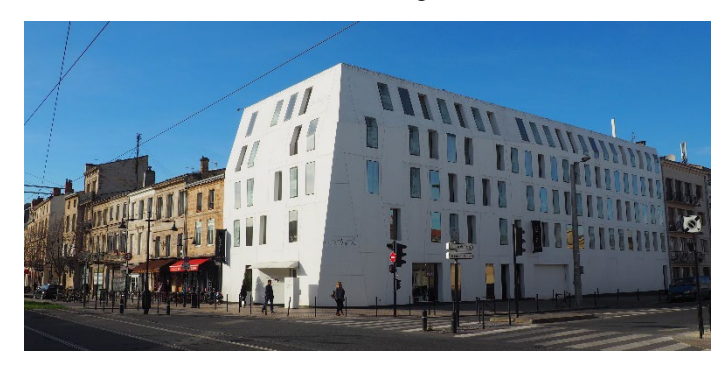
Fig. 5. Hotel Seeko'o.

The remit was to produce a high-end hotel, and this building aspires to be seen and to be a reference point in the city. What is striking at first is its large volume made up of perfectly smooth white Corian<sup>®</sup>. According to the architects, the project was designed on the scale of the city and connections between the neighborhoods.