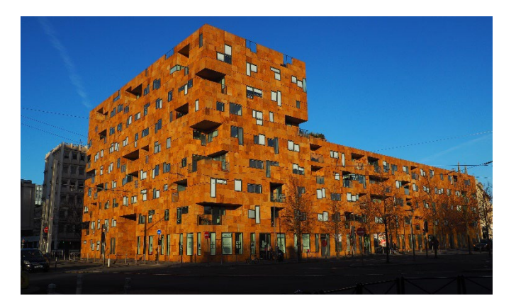
Fig. 6. Square Pey Berland.

city and the largely concrete-dominated ensembles in the Mériadeck district.