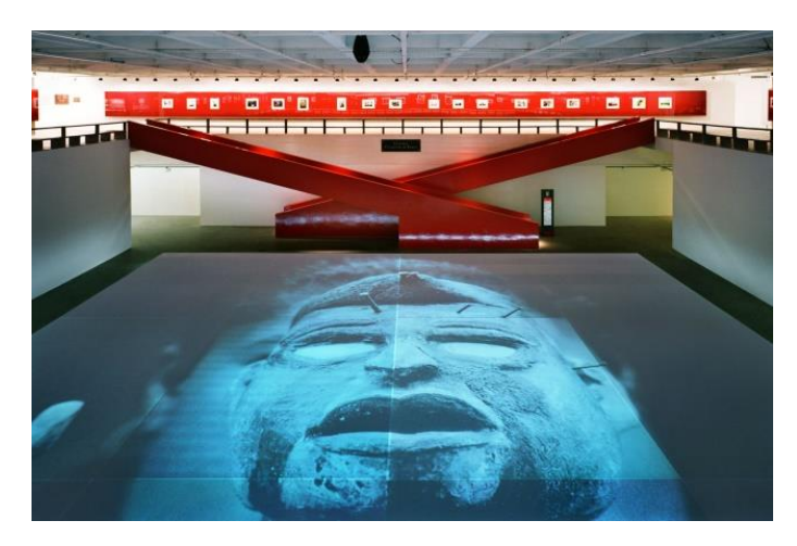
Fig. 2 - Stair-ramps. (KON, N.)