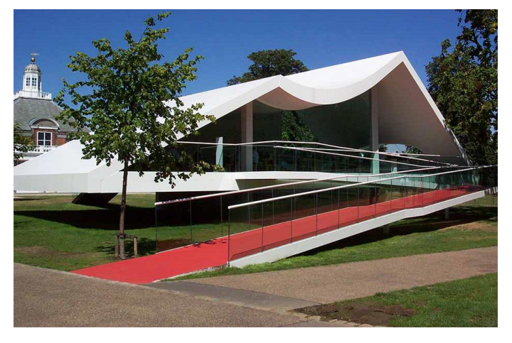
Fig.6 Main facade with access ramp – (Modern Architecture London)