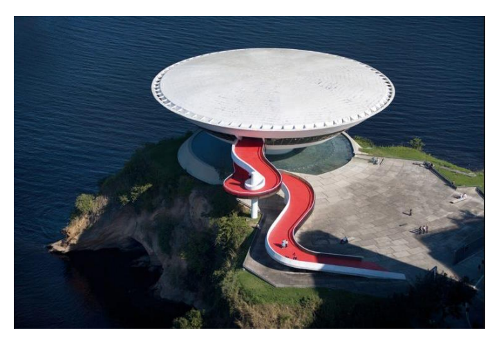
Fig. 5. Museum of Contemporary Art (Leonardo Finotti In: SEGRE, 2010)

that allows visitors to the museum to appreciate all the natural beauty that surrounds it. With its main body at 16 meters high, access is via a winding concrete ramp that allows visitors to appreciate the landscape and the building itself on a 98-meter long architectural promenade full of changing perspectives. The invitation and marking of the ramp take place through its red fire floor, a plastic decision to highlight the access of the large white volume (fig. 5).