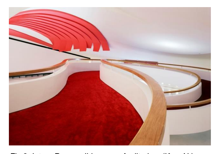
Fig.9. Intern Ramp – Ibirapuera Auditorium (Kon, N.)

Oscar Niemeyer adopts a very controlled color/material palette that uses only white, red, and wood. White is reserved for opaque surfaces built, while the wood is for the handrail and some acoustic coverings. Red is highlighted not for a specific function but for accompanying the user/spectator through their experience in the auditorium spaces. First, it signals the unequivocally with the marquee immediately welcomes the route along the internal ramp (fig. 9) to the audience spaces through the floor covering. It would be a matter of signaling, as in the previous cases. However, the experiential issue is highlighted when it is emphasized when inviting Tomie Otake to make a sculpture in red. The artist's occupation of the wall and ceiling radiate throughout the space through the reflection of color. Red expands its signaling and didactic function to become the poetic accent of the proposal.