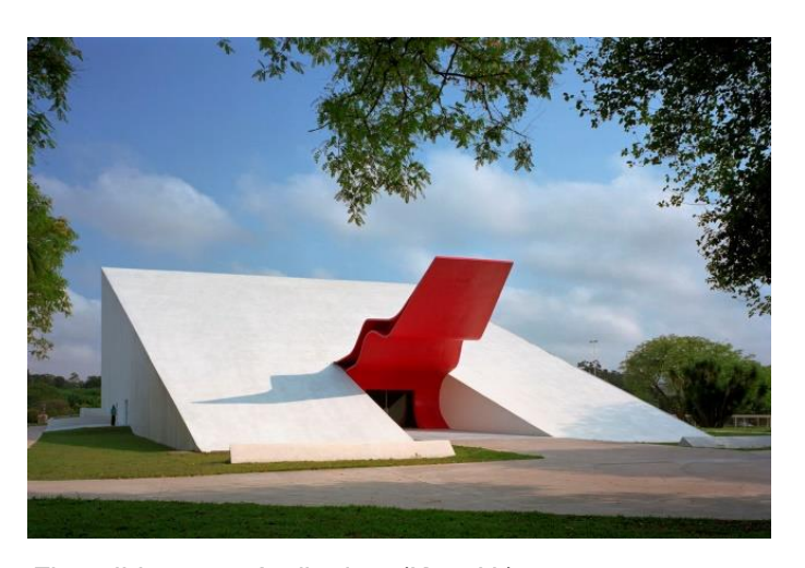
Fig.7. Ibirapuera Auditorium (Kon, N.)

Conceived by the then governor of the state of São Paulo, José Pires do Rio, the park that would be modeled after great European examples such as Hyde Park in London or Boi de Boulogne in Paris. Parque do Ibirapuera occupies a total of 157,000 m² and was only opened in 1954 due to the drainage problem that the land presented. The problem was solved by the then official Manequinho Lopes, who decided to plant hundreds of Australian eucalyptus on the ground to drain the water in the region.