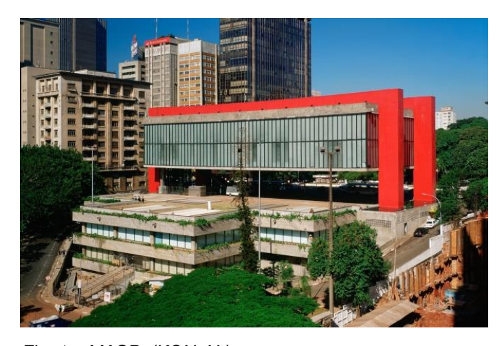
Fig. 1 – MASP, (KON, N.)

On the floors below the span, there are two stair-ramps also in red (fig.2). The proposal made by Lina Bo Bardi, in this sense, reserves the use of red in two distinct functions, structure and circulation. The red elements bring common the desire to signal, point out, and distinguish the elements put in color. Architecture should be understood as a set of elements articulated throughout but with their particularities.