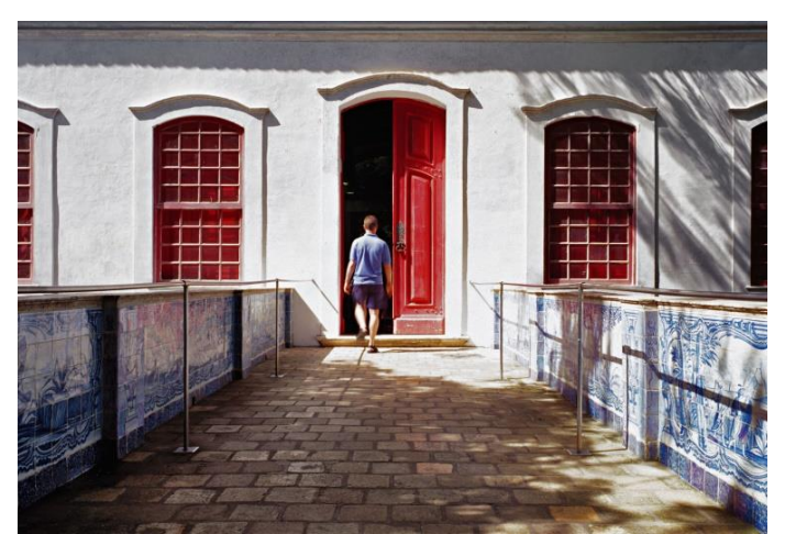
Fig. 3. Solar do Unhão's Entrance. . (Kon, N.)

In the Solar do Unhão project, what can be perceived is the use of red as a signaling act with intentionality close to the use of color in the MASP project. The architect with her choice reveals her look at the historical construction processes belonging to the work involved, the difference between the brick-built in masonry, and the openings treated in wood. By observing the set, one can learn the difference between the fixed parts and the moving parts, employing colors, enabling many other inferences about the architectural qualities.