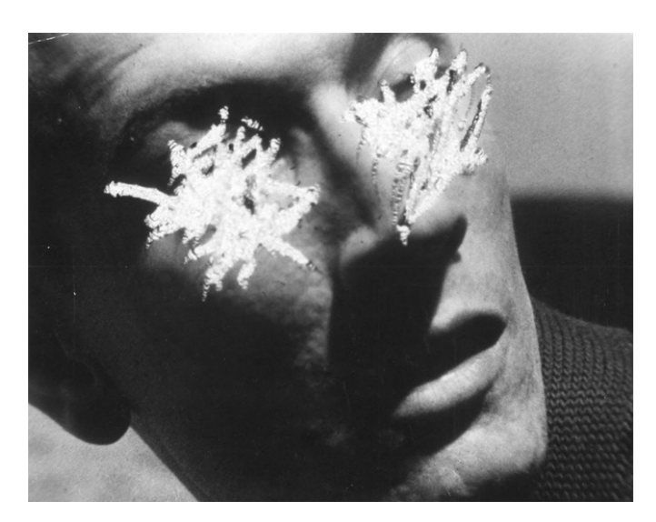
Fig. 1. Reflections on Black (Stan Brakhage, 1955). The man's blindness is symbolized by star-shaped scratches on the film's emulsion.

poisoned by socially-created expectations – in Brakhage's words, "that picture post card effect (salon painting) exemplified by those oh so blue skies and peachy skins" (Brakhage, 1963, p. 25).