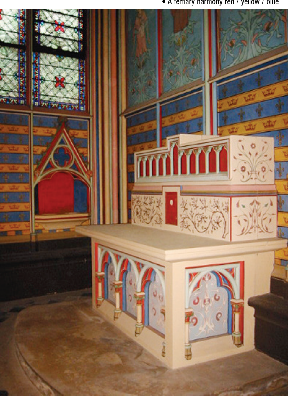
Figure 3 - Cathedral Notre-Dame de Paris, Chapel Saint-Louis