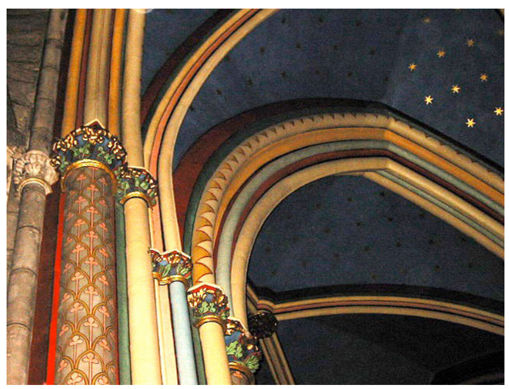
Figure 2 - Cathedral Notre-Dame de Paris, Chapel St-Georges, an example of vault with false starry sky and painted nervures.