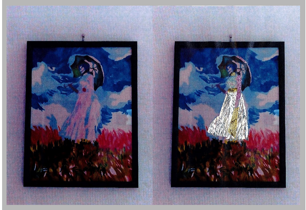
Figure 2 - On right: Reproduction by Michela Lecca of "Study of a Figure Outdoors: Woman with a Parasol, facing left" by Claude Monet (1886. Musée d'Orsay). On Left: here, the Woman modern dressed, with metallic and glittered cloths. How do the new materials change the color sensation and the color perception?

In [5]. Liliana Albertazzi and Osvaldo Da Pos describe a set of experiments to identify the references of colour categories in Italian language. In these experiments, a number of volunteers with different age and gender, were asked to produce through special software digital colours on a screen corresponding to a set of Italian colour names (Giallo/Yellow, Rosso/Verde, Blu/ Blue, Arancione/Orange, Viola/Bluish Purple, Lime/Lime, Carota/Carrot, and so on ... a tentative English translation in italics). The assumption was that there is a special connection between perceived colours and corresponding colour stimuli, so that the colour perceived by the participant who produced the digital colour is about the same colour other people perceive when looking at that colour stimulus. The research showed that most colour terms among those used in the experiments refer to specific perceived colours, since the 'corresponding' colour stimuli are significantly different. Moreover, other colour terms on the contrary refer to the same set of perceived colours, because the difference between the sets of colour stimuli is not statistically significant: the conclusion is that these terms are synonyms.