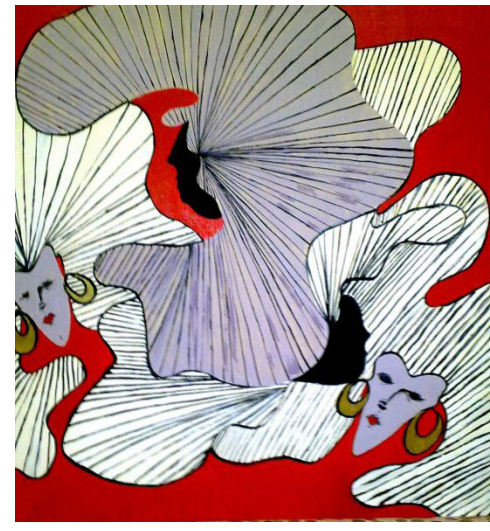
Figure 1 - Oil and acrylic paint on canvas and various materials:from left to right La Donna and Le Maschere. Al.Tallarita 2014.

Figura 1 - Pitture olio e acrilici su tela e vari materiali. Da sinistra a destra La Donna e Le Maschere. Al.Tallarita 2014.