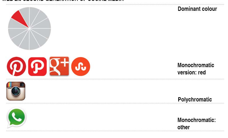
Figure 2 - Web 2.0 second generation of social media: brand and UI colour. From top to bottom: Dominant colour; monochromatic version: red; polychromatic; monochromatic: other