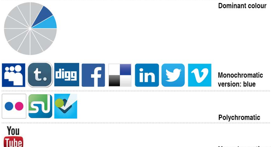
Figure 1 - Web 2.0 first generation of social media: brand and UI colour. From top to bottom: Dominant colour; monochromatic version: blue; polychromatic; monochromatic: other