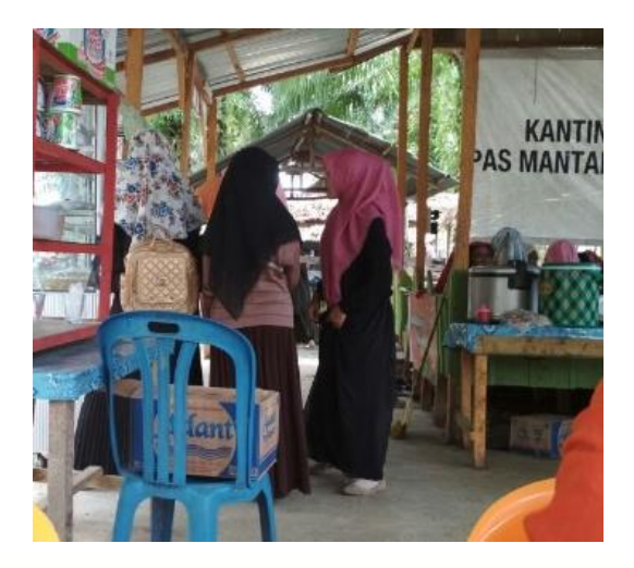
Figure 8: Proximity between female-female non-strangers

By comparison, figure 9 shows another proxemic distance applied by malemale non-strangers. They are also college friends who are sitting for lunch in a canteen, but not sitting next to each other even though there is an empty space next to his friend. In this position, they used personal level of proxemic, namely 1.2 m.