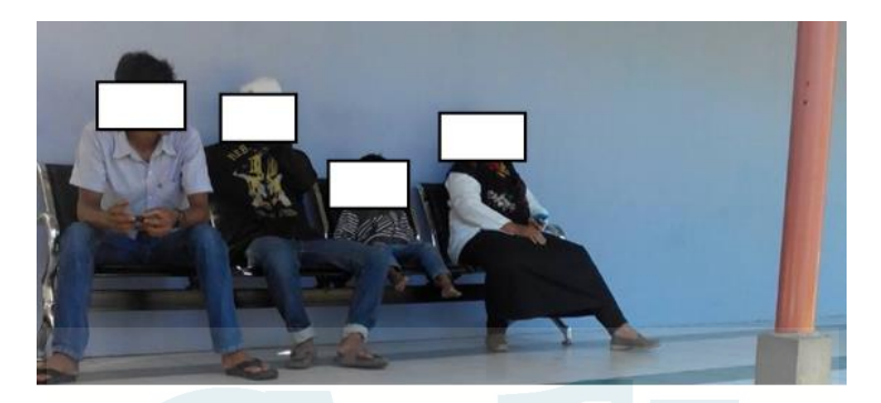
Figure 2: Proximity between male-female non strangers

The picture above shows a family sitting in a hospital bench. The relationship among the participants is male-female non strangers. It can be seen that those people who were waitingare the family members. They are sittingnear with one another without rigidity and look comfortable. The woman is sitting at the edge of the bench, separated from her husband (wearing black shirt) by a little boy. She is not sitting directly next to her husband. Meanwhile, the husband is stilting directly next to man in white shirt.