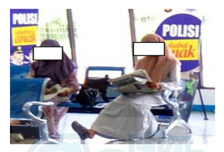
Figure 5: Proximity between female-female strangers

By comparison, there is another picture of female-female stranger proximity, which is shown in figure 5 below: