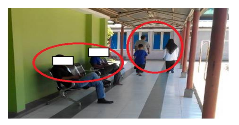
Figure 6: Proximity between male-male strangers

Subsequently, two non-stranger males as showed in Figure 7 are talking to each other within 1.2 m (personal level). In other words, they do not keep intimate level of proximity. In this case, probably it caused by the room safety as stated by Prawitasari (2009) that even though they know each other, it does not mean that they have to sit well in a face-to-face condition.