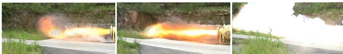
Figure 1: Photographs of 2-m 3 vented tests with cornstarch, iron and aluminium dusts (Taveau et al, 2019b)

Further experiments in 0.5, 2 and 5.6-m 3 chambers have highlighted a scaling issue associated with the venting of aluminum dust deflagrations, which raises doubts concerning the adequate protection of industrial-scale equipment (Figure 2). The lack of agreement between experimental vent area and estimation using the NFPA 68 equation may be related to the inability of the cubic law to capture the volume dependence of metal dusts deflagration severity that has been previously mentioned in section 2.