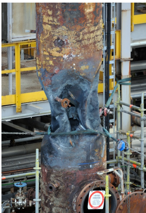
Figure 1: the collapsed shell of the tower

A root cause investigation identified causes including the following: