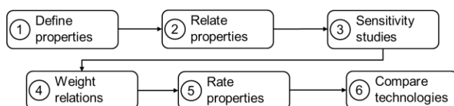
Figure 3: Methodology for the technical rating of utilities

For the next research phases of rating utilities the prospect of some methods under development are presented. Especially a missing methodology for the technical rating will be applied, following the steps in Figure 3. In step 1, properties for a useful SE rating have to be defined as we just did in this work. Additionally, the relations between the single properties have to be set in the second step in preparation for the step 3 sensitivity analysis.