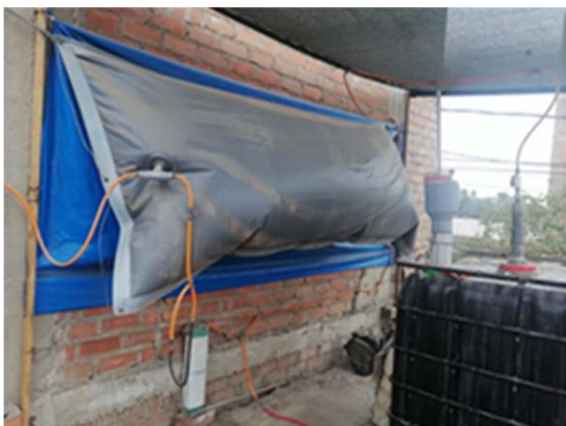
Figure 3. Biogas bag and gasometer