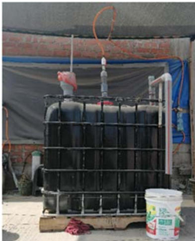
Figure 2: IBC bioreactor

Biomass mixture: The first feed to the biodigester was 1000 L of water, then 233 L of manure-water mixture (58.8 Kg of manure and 175 L of water) were recharged, 6 times per week at each feed (Figure 2).