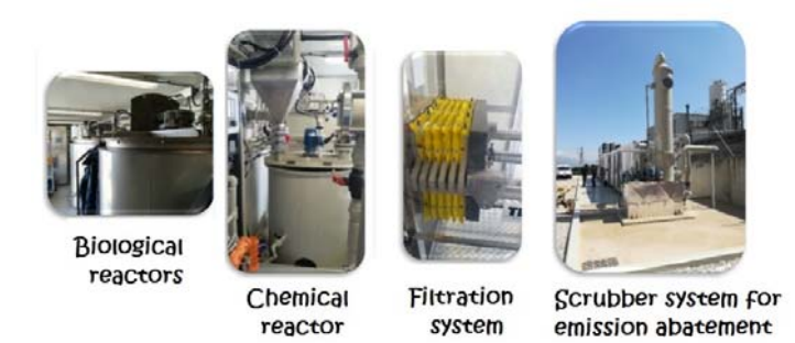
Figure 2: Some pictures of the pilot plant

The pilot plant considered in this study can be viewed as a standard installation of low complexity. HAZOP method has been chosen to carry out this preliminary technical safety analysis. It provides a structured and detailed examination of all parts of the plant. The analysis requires the in-depth acknowledge of the process, the study of the Piping and instrumentation diagrams (P&ID) and the logic control of the operating parameters. The procedure requires to identify the subsystem to analyse (node), pick a process parameter, as for example flow, temperature, pressure, pH and to study possible deviations from intentions by applying the "guide word". More in details, the procedure for HAZOP analysis is to apply a number of guide word to various parts of the plant. Finally, a list of recommend action is suggested. It is possible to find the complete procedure in Crowl et al. 2011. HAZOP procedure if compared to other techniques ( i.e. Checklist analysis) is more comprehensive and complete but also more time-consuming. HAZOP has a higher potential for revealing hidden weak points that can be further developed by other techniques as fault, event tree (FE and EE) and failure mode and effect analysis (FMEA).