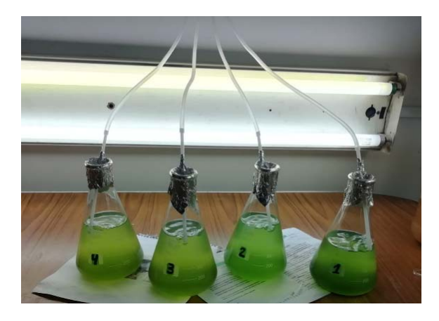
Figure 1: Scenedesmus sp microalgae culture system

It was performed using 8 mL of Scenedesmus sp microalgae in an Erlenmeyer flask, 492 mL of mineral water was added to achieve a volume of 500 mL of culture, 0.07 mL/L of Bayfolan foliar nutrient was applied to seek and achieve the growth of the microalgae. The cultivation system was adapted to a bubble aeration system to have a better circulation of nutrients and avoid strata. The temperature and pH were controlled daily, the lighting conditions were 12 hours of light projection and 12 hours of dark phase, the cell density was performed every six days to show the progressive growth of the microalgae (Figure 1)