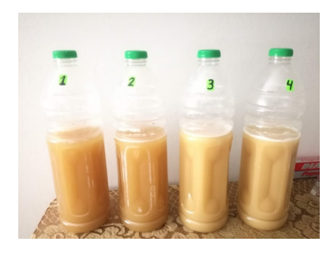
Figure 2: Carbon dioxide generation

For the generation of the carbon dioxide source, 10 g of fresh yeast, 500 g of sugar and 1 L of water were used. The process was developed in an anaerobic medium to generate a uniform fermentation of 4 samples as shown in Figure 2.