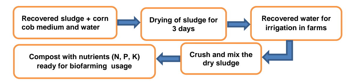
Figure 3: Schematic diagram for nutrients and water recovery for biofarming usage.

To obtain the compost from the effluent, saturated filtering material will be removed from the columns, dried, crushed, and sieved using a 40 mm sieve as shown in Figure 3. Compost will be constantly turned using a rake to ensure moisture evaporation and when dried will be stored in bags made from plastics. Its pH, temperature and other necessary parameters will be continuously checked. Water resulting from the treatment system will eventually be used for the irrigation of crops such as cereal and vegetables. Hence a control quality of bio-products will be obtained from the farms.