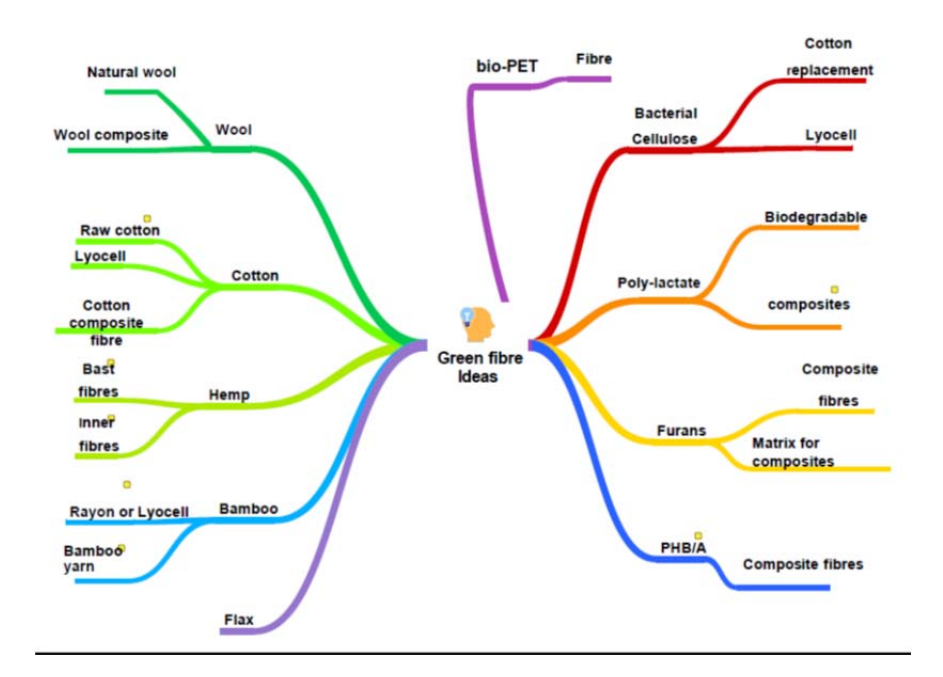
Figure 3: Most plausible green fibres and raw material for green textile fibres.