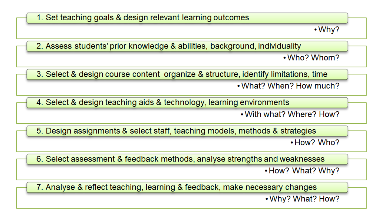
Figure 1 The basic didactic model of Engineering Pedagogy Science (EPS)

The first step in developing a training program is to identify a simple and explicit model that meets the requirements of stakeholders. In this case, the most relevant structure is the basic didactic model of Engineering Pedagogy Science (EPS), e.g., Figure 1. This model has been described by (Ruutmann, 2019) based on the student-teacher partnership supported by an interdisciplinary approach and an integrated learning content that follows a precise and logical structure.