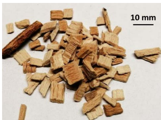
a) The initial sample of wood chips.

Beech chips with moistures 0.50 \pm 0.03 % wt. dry mass, 7.50 \pm 0.01 % wt. dry mass, and 16.0 \pm 0.1 % wt. dry mass was used to carry out the experiments. The solid organic content of 91.70 \pm 0.03 % wt. dry mass was analysed for the given material. The totals solids were determined by drying of 5 representative samples in the dryer KBC-25W at the temperature of 105 °C up to constant weight. The solid organic content was determined by burning of 5 representative samples in the furnace LE09/11 at the temperature of 550 °C up to constant weight. The analytic balance SDC31 was used to determine the required masses. Raw beech chips see Figure 1a, were initially pre-grinded by the knife mill SM300 in configuration with a three-blade rotor, its revolutions of 3000 rpm, and the drum screen sieve with square openings of 10 mm in size.