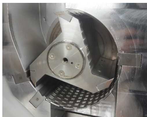
b) The size reduction chamber of the mill SM300.