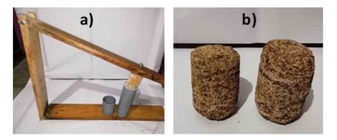
Figure 2: Production of ecological briquettes: a) Manual briquetting press and b) Ecological briquettes

The ecological briquettes were evaluated for chemical parameters such as: