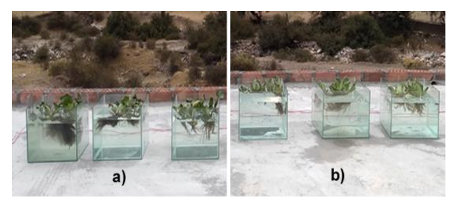
Figure 2: Macrophyte plants: a) Eichhornia crassipes and b) Pistia stratiotes

Figure 2 shows the images of the macrophyte plants used in the study. Eichhornia crassipes presented abundant well-developed lateral roots, with sizes ranging from 2 to 3 cm, and its leaves were rounded and green in color. Meanwhile, Pistia stratiotes presented roots that varied in size from 1 to 2 cm, and its leaves were trapezoid-shaped and green in color.