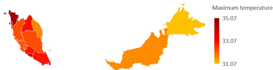
Figure 1: Heat map projected maximum temperature of Malaysia in 2080

Figure 2 illustrates the impact of ambient temperature on power characteristic of solar photovoltaic. It is clearly seen that increase of ambient temperature negatively affects the output power of the solar module. The operation of solar modules at elevated temperatures leads to their accelerated degradation and negatively affects its energy characteristics. The decrease in open circuit voltage when the surface of the solar module is overheated leads to a decrease in the output power of the solar module to 50 % or more. From Figure 2, power output reduced about 5 % when the ambient temperature rises at 35 °C compared to 25 °C.