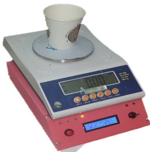
Figure 1: The smart scaling system prototype.

A prototype of smart scaling system based on the developed algorithm and methodology was developed (Figure 1). The system consists of: i) a digital scale with accuracy of 0.01 g; ii) a controller with the scaling algorithm; and, iii) a visual and sound interface. The system operates in two modes: a) calibration mode – to find the critical weight based on the model and package characteristics; and b) weighing mode – the flower cuttings are loaded on the scale until it reaches the critical weight. The visual – sound interface marks when the weight reaches 90% of the critical weight and at the critical weight.