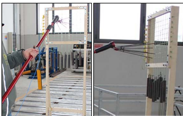
Figure 1: Olive beater and the device to develop tests

Tests were carried out using a battery powered (12 VDC) olive beater (Jolly Italia s.r.l., Trecastelli, Ancona, Italy) with the oscillating head equipped with carbon fibre sticks (Figure 1). The head was mounted on a metallic pole 1.83 m long used as extension arm and the beater was equipped with the electronic control of the beating sticks lowering the oscillating frequency of the comb from 400 to 1400 beats per minute when idle.