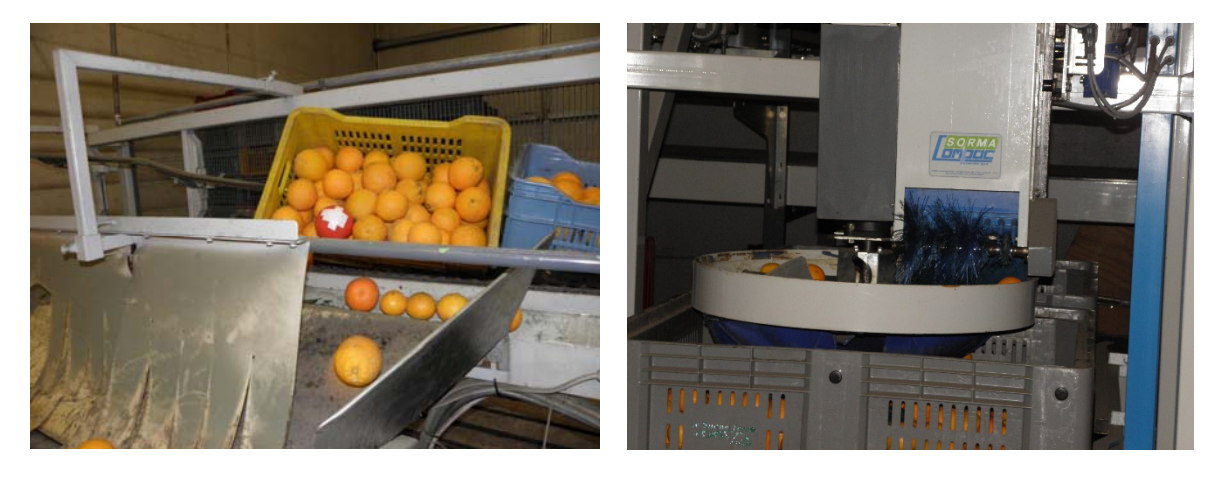
Figure 1: The conventional line feeding system (box Figure 2: The innovative filling system of the emptying).

The experimental activity discussed in this paper was carried out in a citrus packing house where two packing lines were installed. They were equipped with some machines that implemented solutions capable of reducing the mechanical damage to the fruits during the packing process. The first packing line is a conventional one, where oranges, coming from the fields in plastic boxes of 20 kg capacity, are processed up to a first selection. The line feeder consists of an automatic depalletiser and a conventional box discharger (Figure 1). Then fruits undergo to the treatments of pre-selection, pre-sizing, washing (two times, the first by using horsehair rollers, the second by immersion in water), pre-drying with foam rubber rollers, drying in a hot air tunnel, manual selection and sizing by means of an optical calibrator. Due to the plant layout, connection between machines usually requires belt conveyors.