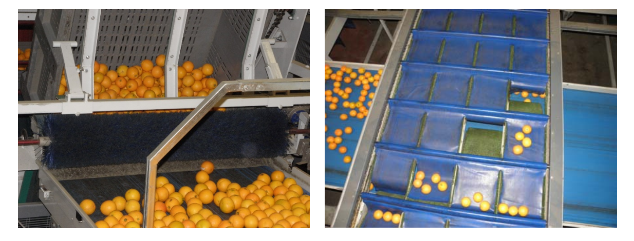
Figure 3: The innovative line feeding system (bin Figure 4: The innovative strip conveyor. emptying).

The second line is used for the final packing before shipment. It processes the fruits selected by the first line and temporarily stored in bins. The feeding of this packing line takes place by means of a dedicated dumper (Figure 3) that first closes the bin with a panel, then turns it and finally moves progressively the panel to allow the slow exit of the oranges on a belt conveyor. A transversal roller, made of soft bristles, intercepts the fruits to slow down their drop velocity and keeps them on the belt conveyor; this moves away the fruits before the arrival of the incoming ones and avoids the fruit-fruit impacts. Successively, oranges arrive on a selection bench and then on an innovative strip conveyor (Figure 4) that gently release them along the width of a lower transversal belt conveyor. Then the oranges are subject to waxing, drying with hot air, sizing with another calibrator (same model of the one installed in the first line) and packing. This may be manual on a suitable bench where operators put the oranges in cardboard or wood boxes or automatic in packing machines that make up nets of prefixed weight.